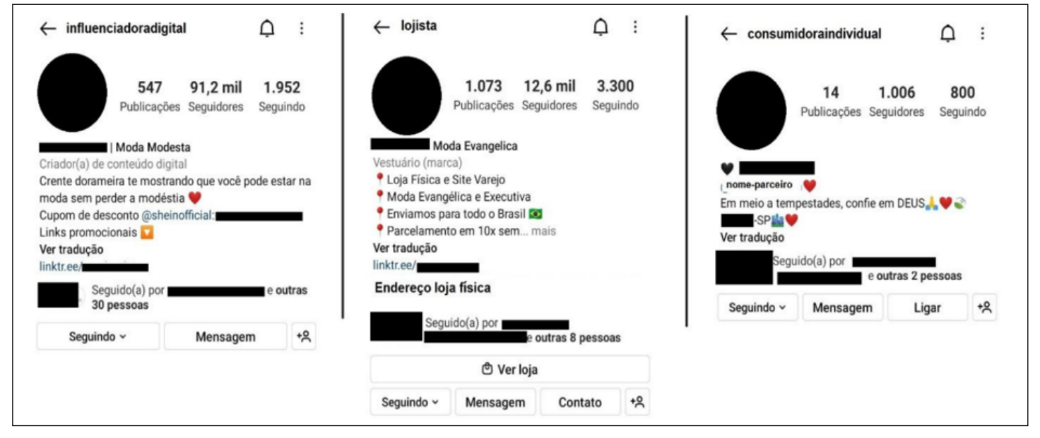
Figure 1. Actors' Instagram bios in the modest fashion market.

The bio is a kind of succinct user biography. Some common characteristics were perceived among market actors in the profiles referring to the modest fashion market observed during the data collection period. Regarding noncontent-producing users (consumers), the bio often uses inspirational phrases, professions, beliefs, and indications of relationships. On the other hand, when it comes to contentproducing users (influencers or Christian singers), most bios are intended to present the mission of that profile, usually linked to solving a problem for their followers. Finally, there are still bios related to companies (shopkeepers), in which other social networks, shopping sites, contacts, missions, and target audiences (B2B/B2C) are usually mentioned. These characteristics are presented in Figure 1.