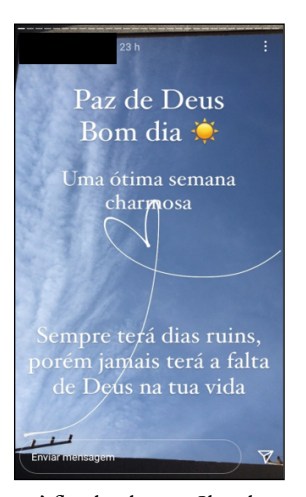
Figure 2. Actors' fluid roles — Shopkeeper profile.

Each market actor plays a specific role, even though there is no explicit agreement between the actors on how their actions will take place. Instagram's infrastructure contributes to demarcating spaces. Thus, consumers become spectators and evaluators of other profiles. Digital influencers inspire other users, influencing the purchase or use of a particular product through store partnerships. Christian singers inspire a Christian lifestyle, encouraging a particular product/service. However, it is possible to notice market actors' fluid actions in the network. For example, some shopkeepers sometimes behave like consumers and influencers. In other words, actors can be recognized as entity X, but they can perform activities of entities Y and Z. This type of behavior is accepted and even required in the social media infrastructure, such as Instagram — where the connection with the target audience is essential to generate engagement. Thus, the actors' variable ontology is corroborated since their objectives and interests are continuously reconfigured in their networks (Callon, 1998). Figure 2 illustrates the analysis.