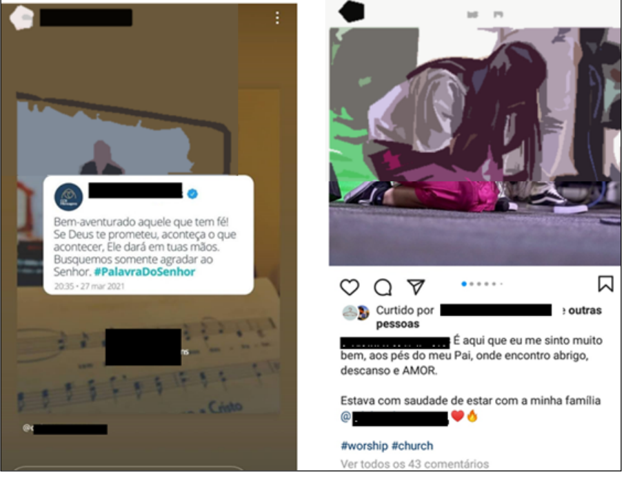
Figure 5. Pentecostal tradition maintenance through Instagram.

By positioning themselves on social networks, actors in this market seek to demystify opinions about their group, for example, 'evangelical women are cheesy, tacky' (as seen in influencers and shopkeepers' profile reels). This excerpt from the influencer Maria illustrates that: