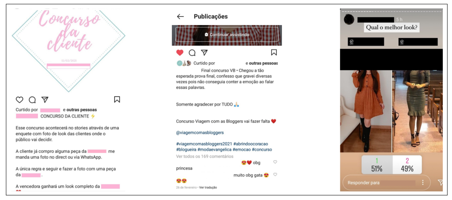
Figure 3. Contests on the Instagram network.

Through computed data, Instagram can continuously adjust and redesign its operations to develop its services (Alaimo & Kallinikos, 2019). With user growth on the network, some interviewees stated that they constantly need to post and use all available resources for Instagram to disseminate their content and recommend their profile which, indirectly, underscores the economic objective that it serves (Alaimo & Kallinikos, 2019). In addition, to favor the user's role (consumer) on the network, the influencers and shopkeepers promote contests and award prizes to followers who interact with the profile (comment, follow, share, save). Figure 3 illustrates the assertions.