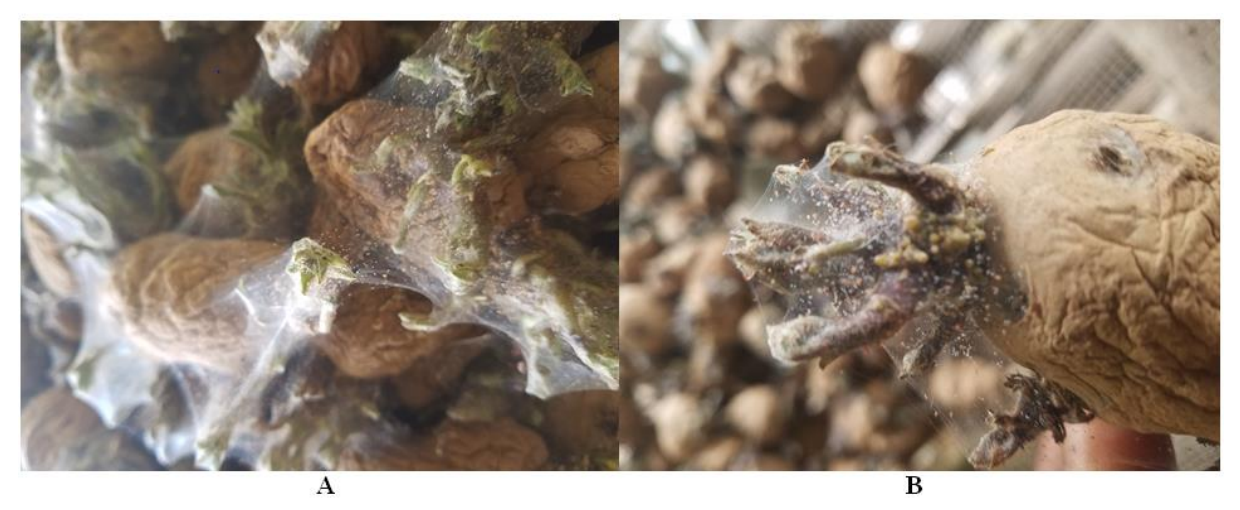
Figure 1. Potato tubers infested by the two-spotted spider mites in KARC DLS. (A) Tubers covered by spider weblike structures; (B) A swarm of eggs and adults of mites on sprouted potato tubers and dried tips by TSSM infestation.

al., 2017). The study of spider mite population dynamics, prompt control of their numbers in agro- and biocenosis, and the removal of trade barriers based on international plant quarantine are all dependent on the accurate identification of spider mite species (Li et al., 2015; Razuvaeva et al., 2023). The Tetranychidae family is currently diagnosed using biochemical (protein-based) and molecular (DNA-based) approaches, as well as identification by adult morphological trait techniques (Razuvaeva et al., 2023). The principles of the morphological approach for identifying spider mites have made a significant contribution to the management and ongoing scientific study of the pest, in which the concepts derived from earlier research remain applicable (Mitrofanov et al., 1987; Mehle and Trdan, 2012; Popov, 2013; Konoplev et al., 2017).