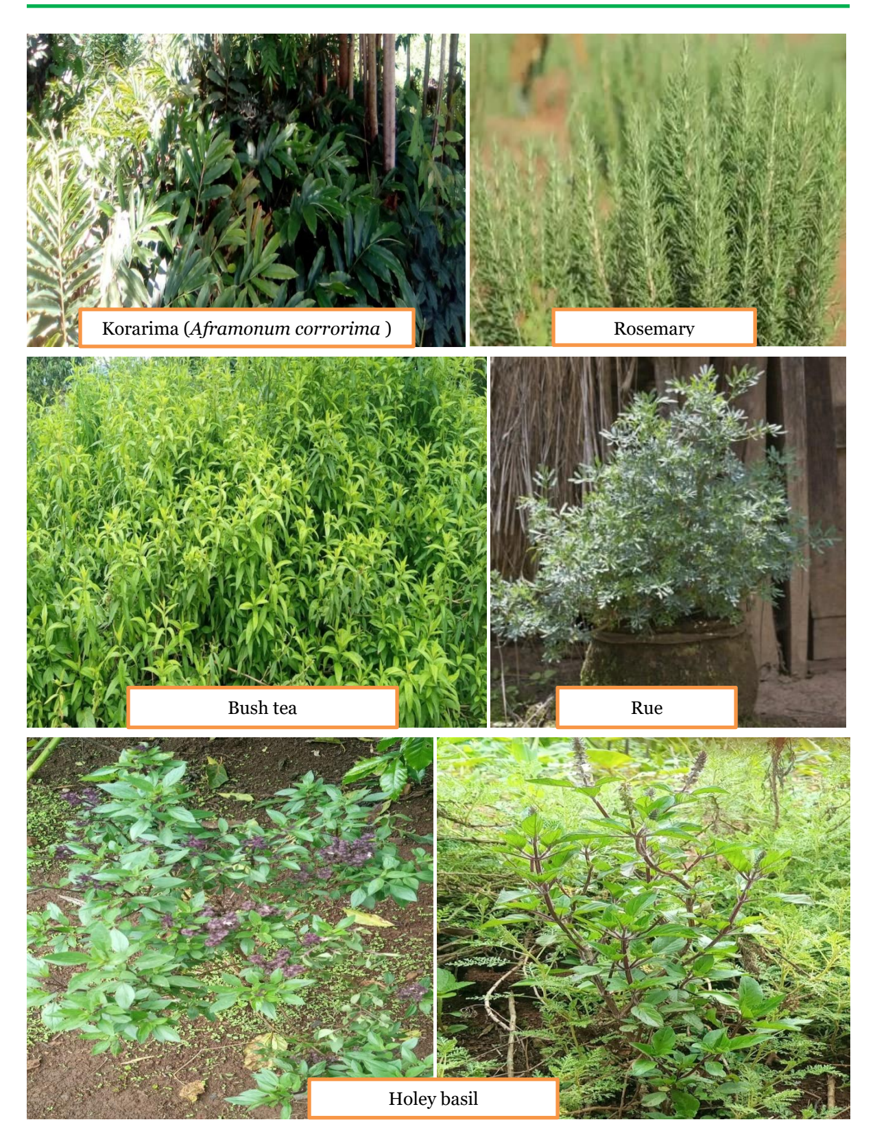
Plate 1. Major spices produced in the area of Kaffa Biosphere Reserve, Ethiopia.