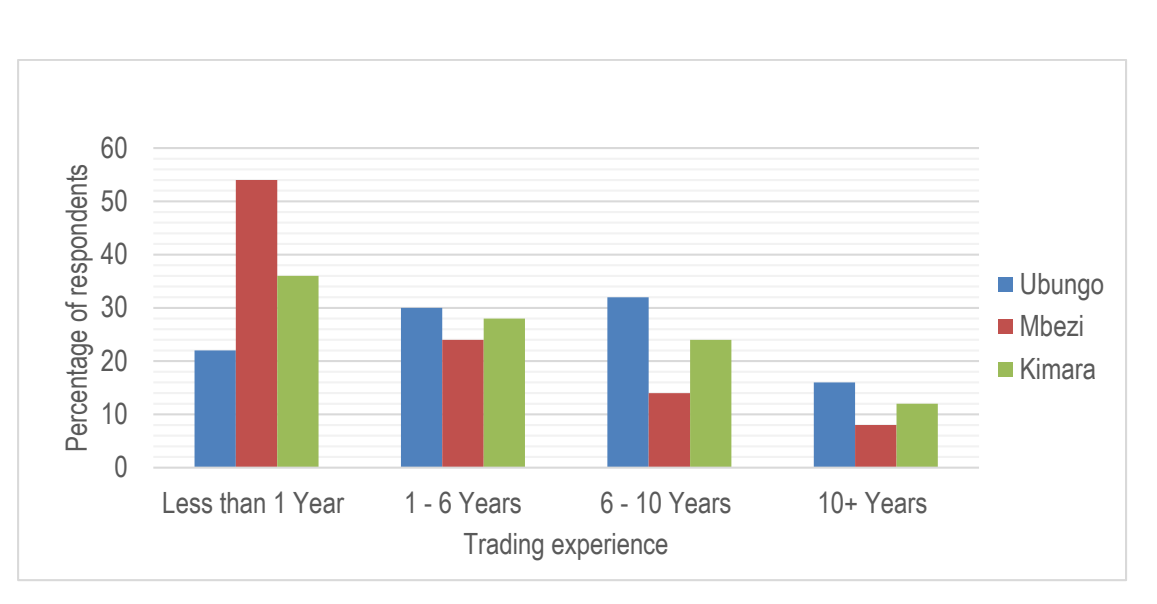
Figure 1: The trading experience among petty traders in the study area

As indicated in Figure 1, the findings reveals that 37.3% of respondents had trade experience of less than one year, and they were categorised as less experienced traders. There were variations across the trade zones where Mbezi had a high percentage (54%) than Kimara (36%) and Ubungo (22%). On the other hand, the findings reveals that 27.3% of all surveyed petty traders had a trading experience of one year up to six years and were categorised as moderate experienced traders with 28%, 24% and 30% from Mbezi, Kimara and Ubungo, respectively. Either 23.3% of all surveyed petty traders had trade experience of six years up to 10 years and were categorised as experienced traders. The last category of petty traders on the basis of experience were categorized as more experienced traders who had more than ten years in trade. This group involved few members of all the groups (12%) with high percentage from Ubungo (16%). Ubungo trade zone had a relatively high percentage of more experienced traders because in previous years (before February, 2021) Ubungo has been serving as a major bus terminal where many people used the area for moving in and out of Dar es Salaam region, which attracted petty traders to remain and continued with their business in the area.