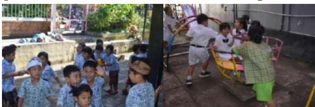
Figure 4. The students are playing

The transformation of Balinese Satua values in Gen A characters can be seen in their attitudes and behaviors that are presented when they hang out and play with their friends. They are very familiar, tolerant, disciplined, creative, democratic, curious, friendly, peaceful, caring for the environment, caring for the social, and responsible. The activities of Gen A shown in figure 4 below.