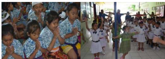
Figure 3. The students are praying, having exercise and singing

These students have heterogeneous attitudes and behaviors. Their characters are relatively spoiled, egocentric, less independent, less confident, and less responsible. Education and strengthening the character of Gen A, they are trained in gymnastic, singing, praying, playing, and cultural activities every "Thursday culture" day, regularly and continuously, so that it becomes a habit and culture. The activities on Thursday Culture, are models of character education, which contains Balinese cultural activities such as Masatua Bali, speaking in Balinese, playing traditional Balinese games and singing Balinese folk songs. The activity of strengthening the character of Gen A at the research location, is shown in figure 3 below.