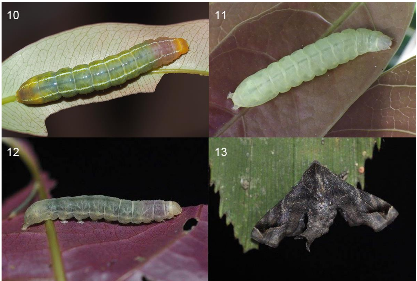
Figures 10–13. The Euteliinae in Taiwan and Kinmen. 10–12. Immature stage; 13. Adult. 10. T. delatrix (Guenée, 1852), Taiwan; 11. ditto, Kinmen; 12–13. Penicillaria jocosatrix Guenée, 1852, Taiwan.