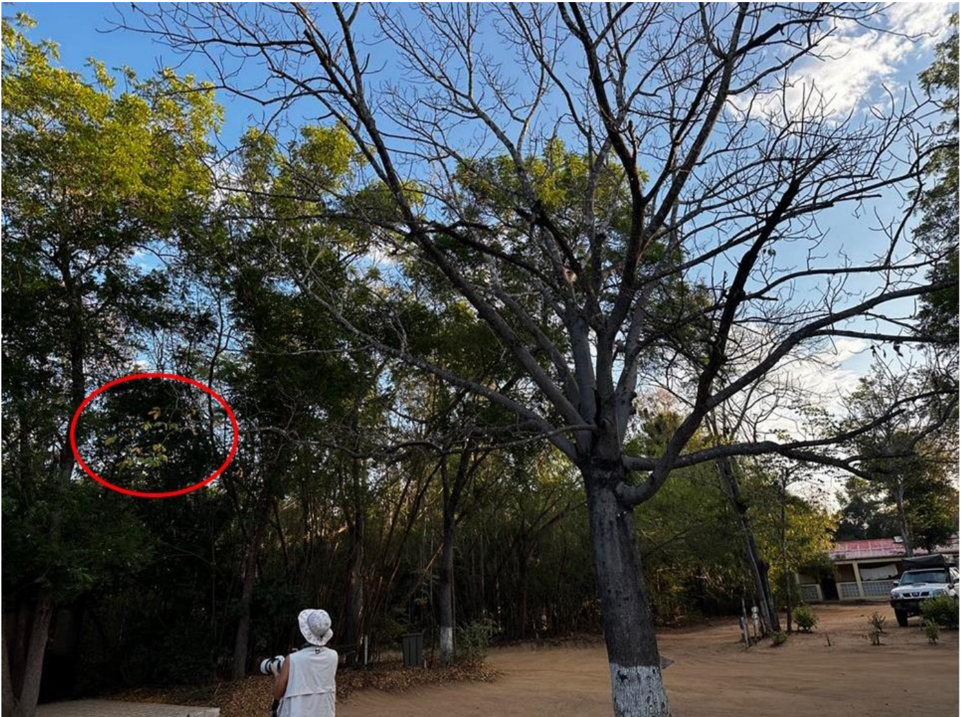
Figure 2. Only a few leaves remain on the tree, and the resting place for adult insects is on the underside of the leaves marked in red.