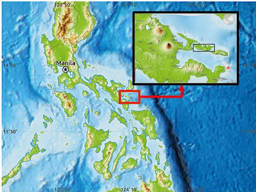
Figure 1. The map shows the location of Batan Island, Albay province, Philippines (inset, black box).