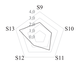
Figure 4. Average rating of statements related to "Employee's daily behavior" (scale of 1–5)