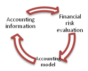
Fig.1. The accounting model - financial risk connection

From the very beginning, both concepts can be noticed to refer to the financial activity of the company, where the accounting information is the bridge between the accounting model and the evaluation of the financial risks, the drive and the key factor of the success in business, more exactly reaching the objectives (fig. 1).