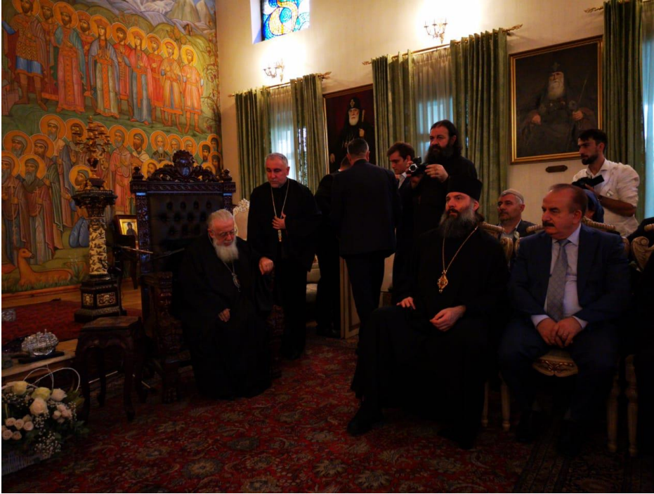
Fig. 5. Catholicos-Patriarch of All Georgia Ilia II, left, in the company of Congress participants. Tbilisi, Georgia, September 29, 2018

On September 29, 2018, as part of the Congress's activities program, a visit was made to the residence of Catholicos-Patriarch of All Georgia Ilia II ( Figure 5 ).