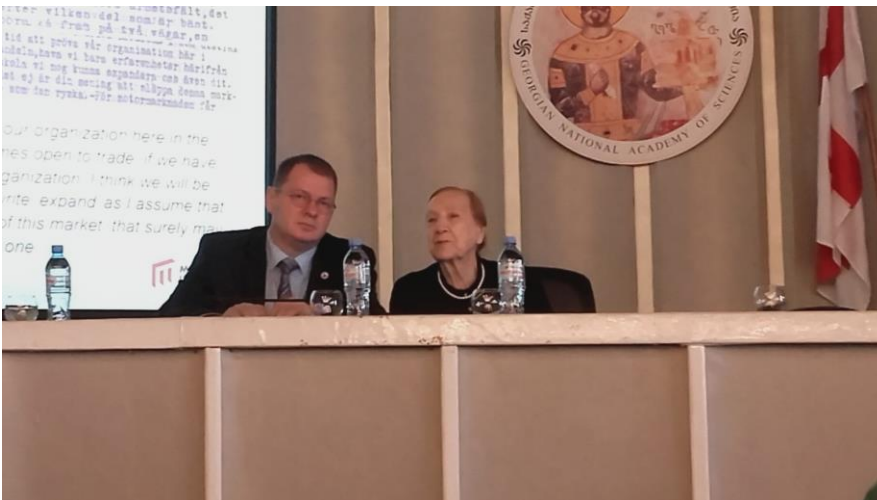
Fig. 4. Plenary session of the Second International Kartvelological Congress. Tbilisi, Georgia, September 28, 2018