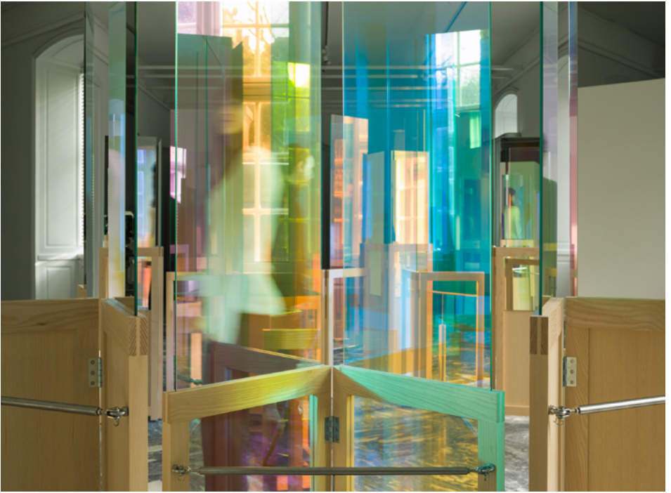
Figure 3. Nicholas Thomas Lee and Peter Alexander Bullough, Vanity Chamber , Vanity Chamber multiplied interior reflections, 2022. (Photo: Hampus Berndtson).

Solid steel counterweights, inspired by those used in traditional sash-windows, were introduced on the inner ring of larger frames supporting the dichroic glass panels to increase stability (Fig. 7). The relative positioning of the fourteen frames, their angle in relation to one-another and the window bays of the museum gallery was orchestrated to maximize the specular effects experienced by the museum visitors (Fig. 3).