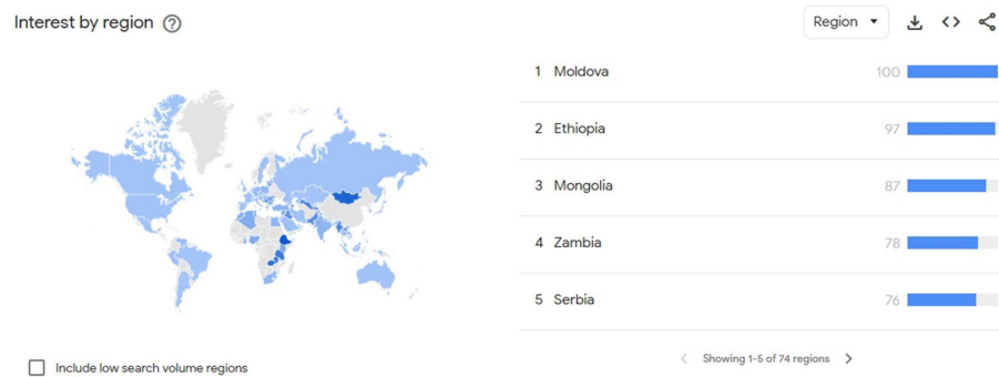
Figure 2. Google search for term „zoo sex“, worldwide interest per region, in period 16.02.2023-12.03.2023.

The graph represents the curve of the number of searches per day, while the vertical axis shows the sums of daily searches for that term. There were not more than 100 of them in one day in the period in question, but, at the same time, there were more than 50. When we talk about the geographical distribution, we can see it in the following illustration.