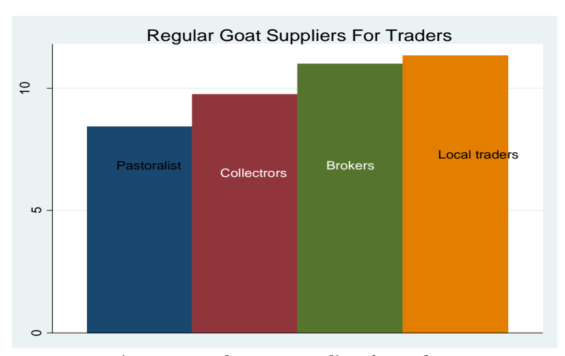
Figure 1. Regular goat suppliers for traders.