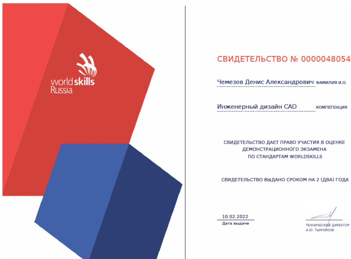
Figure 2 – The demo exam expert certificate.