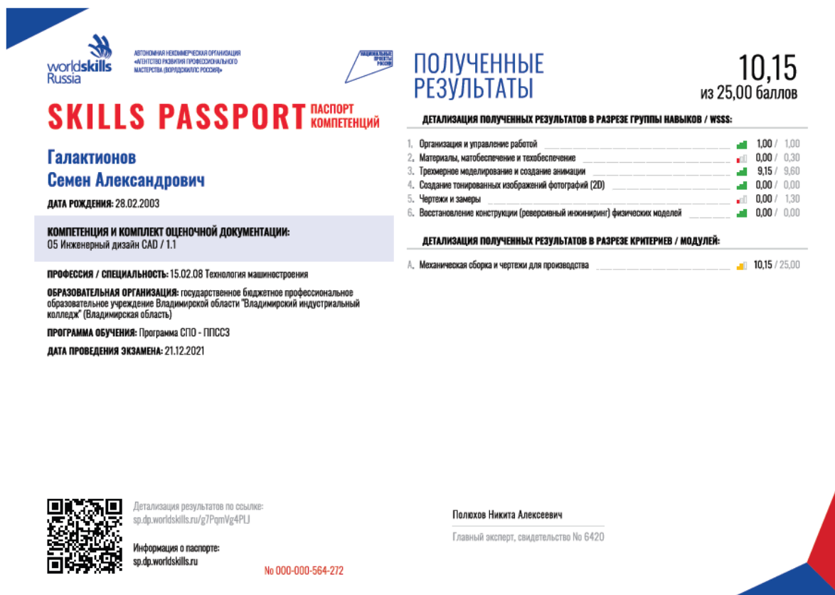
Figure 3 – The Skills Passport of a student of the Vladimir Industrial College after completing the task at the demo exam.

The participants in the demo exam perform the mechanical assembly of a mechanism or unit and the drawings for production. The evaluation of the work performed is carried out according to the following criteria: organization and management of the work; materials, software and technical support; 3D modeling and creating animation; creation of toned images of photographs (2D); the drawings and measurements; reconstruction of the design (reverse engineering) of physical models. The demo exam participant's Skills Passport is generated after scoring [10]. The Skills Passport of one of the participants in the demo exam for the "Mechanical Engineering CAD" skill is presented in the Fig. 3.