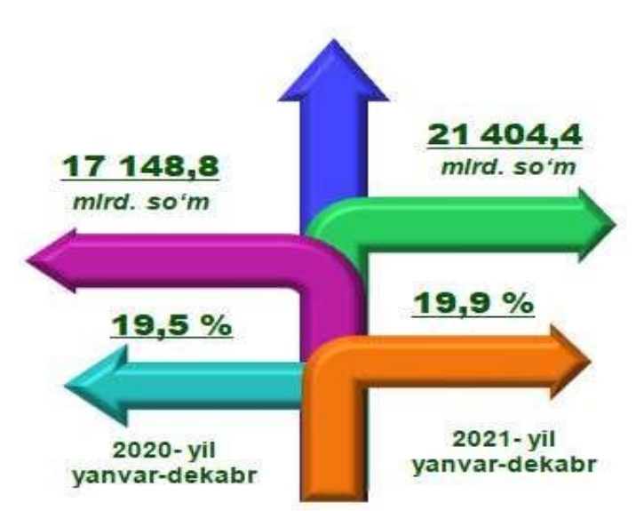
Picture 3. Share of construction work contributed by the informal sector

A total of 5,611.4 billion soum construction works were completed by state-owned organizations, while 101,836.2 billion soum construction works were carried out by non-state owned organizations. Their share in the republic was 5.2% and 94.8%, respectively.