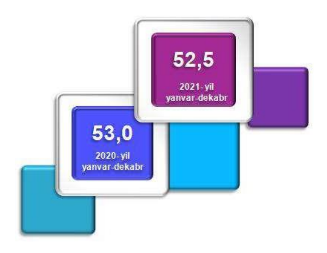
Picture 2. Small contract enterprises and micro-firms and their share in %

In the reporting period of 2021, the highest share indicator by small contracting enterprises and microfirms is Tashkent city (13,193.4 billion soums or 50.0% of the total volume), Tashkent region (4,749.8 billion soums or 52.2%), and Samarkand region (4,580.6 billion soums or 63.4%). The share of construction works accounted for by the informal