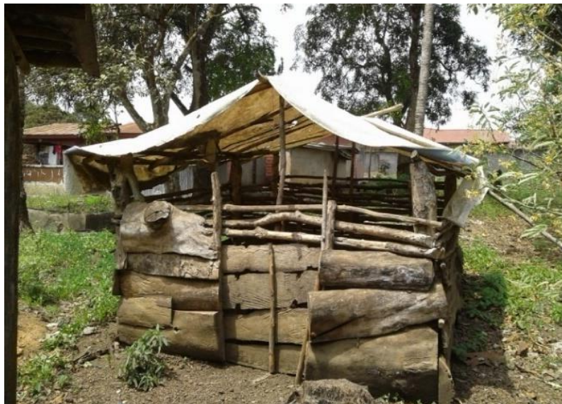
Plate 2. Pigpen built with stick and tapeline.

were lacking, hence pigs were fed in metal plates, rubber and wooden containers (57.1%) (plate 5). Bared floor (16.2%) and cement/concrete (26.7%) floors also served as feeding troughs (Table 3). The method of feeding was poor which could possibly result in infection and feed wastage.