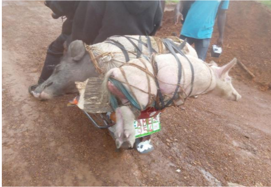
Plate 6. Plate pigs on their way to market on a motorbike.