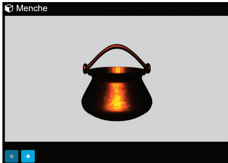
Fig. 1. A three-dimensional cultural-historic resource.

Three-dimensional technologies are becoming more important in the areas of digital libraries and e-learning, offering virtual reality for the Internet. Presenting 3D objects allows learners to thoroughly examine and compare not only visual, but also spatial characteristics of the artifacts. In addition to improving the visual presentation, they are also an excellent tool for maintaining student engagement and helping with the education for cultural heritage and national identity for children. To increase children's access to cultural-historic resources and introducing them to the values of their cultural heritage, we have developed a set of components and an online platform for visualizing virtual three-dimensional learning environments in the web browser (Georgiev & Nikolova, 2020). They can be configured to show standalone objects, as well as complete and interactive virtual environments.