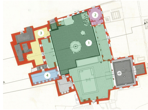
Fig. 1. 2D Plan of the Bardo palace, marble courtyard level.