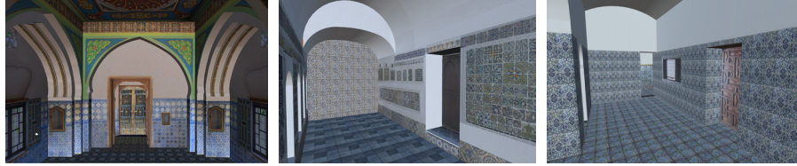
Fig. 6. Results of the 3D modeling of the room of the favorite, salons and, Skifa.

Photogrammetry should not be employed for modeling architectural spaces since the creation of a dense point cloud and the mesh took more than 48 hours in our experiment (Fig. 7), using 124 photographs. Table 1 shows a comparison between the results obtained in photogrammetry and in geometric modeling using SketchUp.