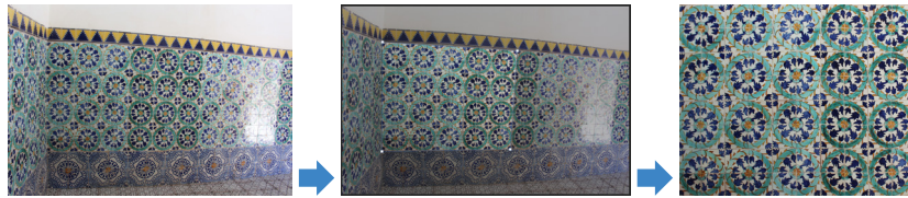
Fig. 3. Wall tiles of the salon, before and after the use of the perspective crop tool.

The number and size of textures may compromise the fluidity of navigation. For the patterns that are repeated on large surfaces, we have grouped, when possible, several patterns in the same texture, to cover a maximum of surface instead of using individual textures for each model (Fig. 3).