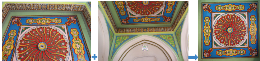
Fig. 4. Panoramic images created for a ceiling based on a combination of perspective crop tool and manual panoramic (Room of the favorite).

When required, panoramic images can be made from several photos, such as when the patterns did not repeat uniformly over the entire surface, for instance when the distance is too short to take the entire surface in a single photo (walls and ceilings). The panoramic can be created automatically depending on the software. We opted for a manual panoramic by first correcting the perspective on each of the photos then making a collage (Fig. 4).