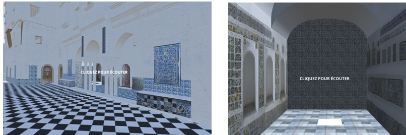
Fig. 5. Example of messages for the activation of annotations/audios: (left) in the marble courtyard and (right) Skifa.

public class SwitchScene : MonoBehaviour { public string destination_name; public KeyCode key; [...] void Update () // called once per frame { if (Input.GetKeyDown(key)) { Scene currentScene = SceneManager.GetActiveScene(); if (null != currentScene) { SceneManager.UnloadSceneAsync(currentScene); } SceneManager.LoadScene(destination_name); } } }