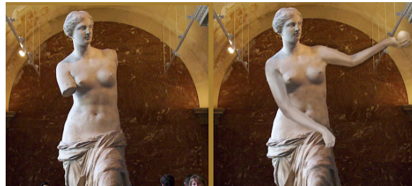
Fig. 1. Photoshop reconstruction of Venus de Milo

online presentation. For example, it is obvious that within the framework of a human life it is hard to visit all the cultural or historical monuments, relevant to our national historic memory, while at the same time a large part of them can be digitized and made accessible through a web browser or a smartphone application. The technologies are constantly evolving and devices such as 3D scanners and printers are already a reality, so many of the ancient culture artefacts can be digitized to an extent good enough to restore a destroyed building from its digital copy. Such technology will be used to restore the world-famous Notre Dame cathedral, which has recently suffered from an accidental fire. Similar attempts are already made, for example, with some statues (Fig. 1), as over time many of them have lost parts of their bodies, and restorers can only focus on the remaining fragments (Saber Point, 2013).