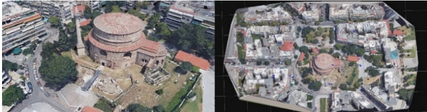
Fig. 3. Visualization of Rotunda 3D reconstructed model from different viewpoints.

The 3D reconstruction of Rotunda was made as a plan of extracting simple models with relative low-level of detail, using the minimum available resources, without using self-collected images either from the ground or from drones. For this purpose, we imported images of the monument publicly available on the Internet. Our main source was Google Maps/Earth. We followed the same technique in collecting images that is used in 3D reconstruction shooting missions, which is capturing Rotunda structure from many viewpoints and angles as possible. Images of the model that we managed to create are shown in Fig. 3.