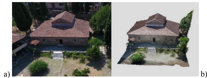
Fig. 2. The church of Saint Nicholas Orphanos. (a) An RGB image captured from a drone. (b) Visualization of the 3D reconstructed model.

Collecting images in both monuments consisted of mostly orbiting a drone around them at different heights, respecting always the corresponding flight regulations. However, these regulations, along with avoiding collisions with nearby objects (trees, buildings, etc.), would had a negative impact in capturing the close-by details of each monument. For that reason, we collected additional images from ground cameras, solving this problem partially.