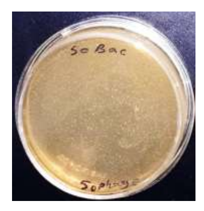
Fig. 3. Double Agar Overlay plate used after the optimization of the isolated bacteriophage growth conditions. In optimized conditions, isolated phage plaques were formed as distinct clear dots on the plate surface.