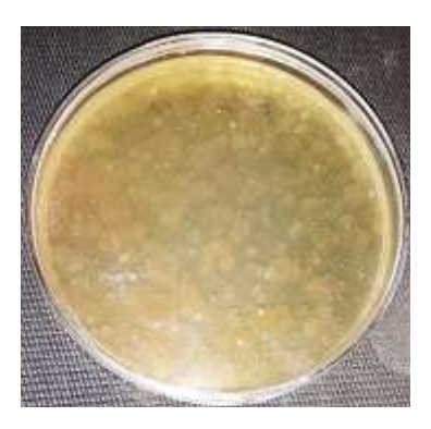
Fig 1. Double Agar Overlay plate used to separate phage. Clear areas were phage plaques. This plate was from before the optimization experiments

of the culture medium was 7. The results of the optimization tests are shown in Figure 2. Isolated phage plaques were formed as distinct transparent dots on the plate surface in these optimized conditions. Figure 3 shows the image of a Double Agar Overlay plate after optimizing the isolated bacteriophage growth conditions.