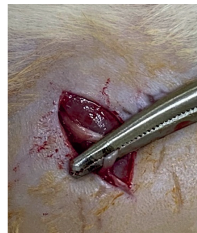
Figure 1. The compression of the sciatic nerve at a position 5 mm from the tip of the forceps.

The IgG levels were measured at 5 mm from the distal nerve lesion. The sciatic nerve tissue was homogenized in 600 \mu L PRO-PREP solution. Furthermore, cell lysis was induced by incubation for 20-30 minutes in a refrigerator at -20°C. Centrifugation was carried out at 13,000 rpm at 4°C for 5