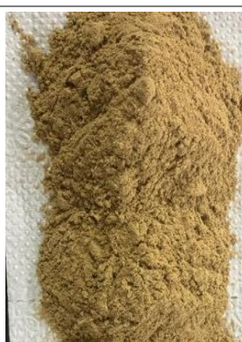
Figure 3 Market sample 3