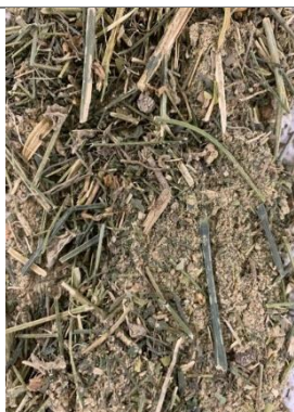
Figure 2 Market sample 2