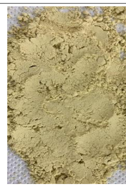
Figure 4 Market sample