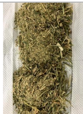
Figure 1 Market sample 1