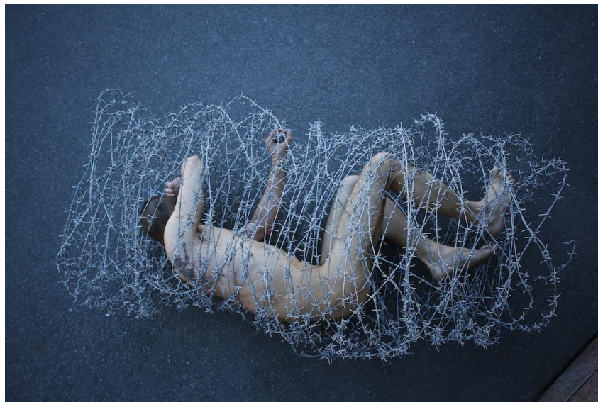
Picture 1. “Carcass” (2013).

On May 2013, Pavlensky held a political protest against repressive government policies. His art performance was called “Carcass”. His assistants brought him naked, wrapped in a multilayered cocoon of barbed wire, to the main entrance of the Legislative Assembly of Saint Petersburg. The artist remained silent, lying still in a half-bent position inside the cocoon, and did not react to the actions of others until the police with the help of the garden clippers released him.