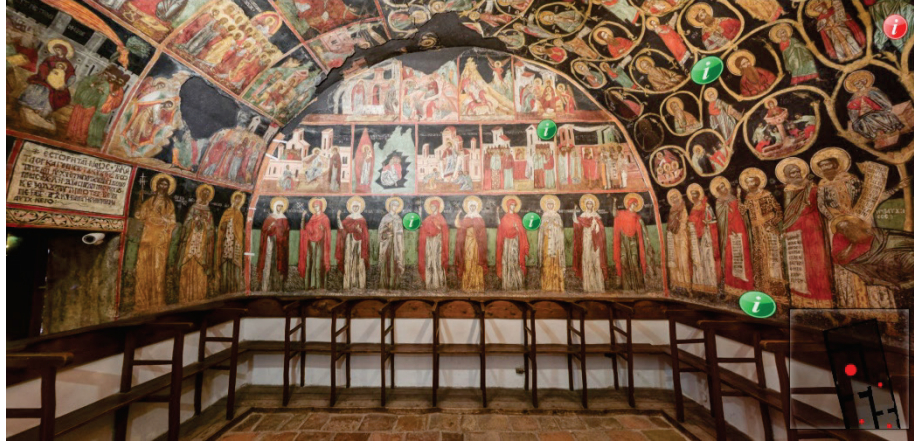
Fig. 2. The green hotspots are placed at the selected icons which are existing in BIDL database

By clicking on a hotspot, the image and description of the icon in BIDL is online presented in Bulgarian and English.