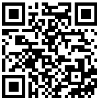
Fig. 5. QR code to download Eötvös 100 application