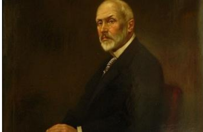
Fig. 1. Roland Eötvös

Eötvös can be a veritable role model in numerous careers even today (Patkós, 2020), (Dobszay, Estók, Gyáni, & Patkós, 2019).