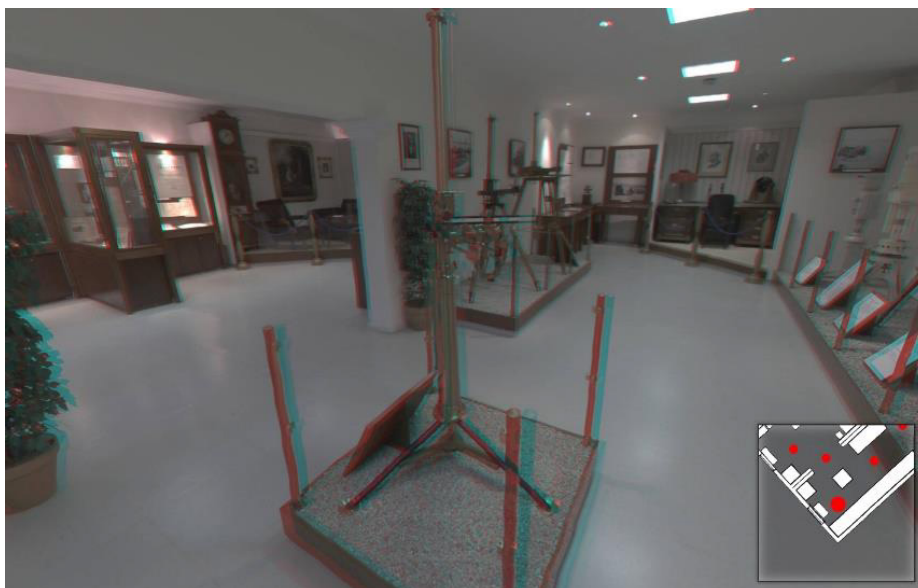
Fig. 6. A shot from the virtual tour to the Eötvös Loránd Memorial Exhibition. Anaglyph glasses are required to see it in 3D.

Roland Eötvös has performed field measurements on Ság Hill, Western Hungary (Kovács, Tiszteletadás Eötvös Loránd Ság hegyi gravitációs méréseinek , 2020). SZTAKI created panorama pictures on the scenes of the original measurements and created a virtual walk using these photos. The result is a sample virtual discovery tour for outdoor environments ( http://files.elearning.sztaki.hu/Escape3D/Sag-hegy ).