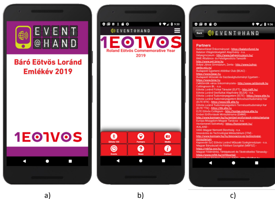
Fig. 4. Screenshots from the mobile application a) Opening screen b) Main menu c) Project partners

cation family can meet a wide variety of demands and trends of the present life. It consists of more than 60 multilingual offline applications running on smart phones and tablets and provide tools and interactive services for mobile exploration of places, events, organisations, cultural objects, etc. The content of the applications can be uploaded, stored, managed and maintained with the help a Web-based Administration System (Márkus & Wagner, 2011).