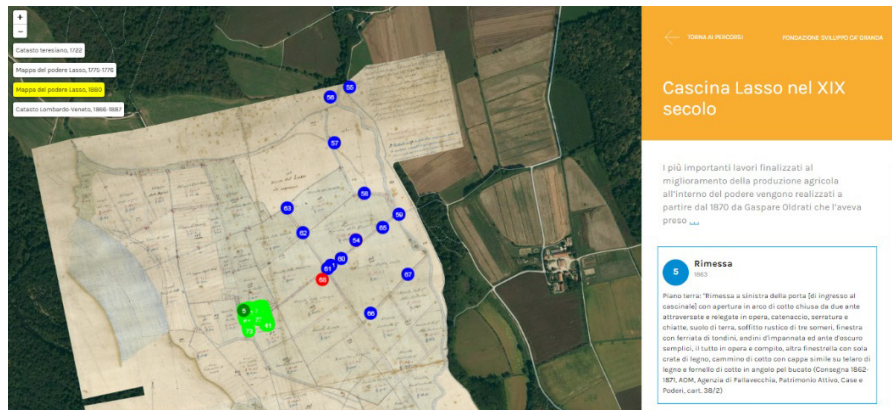
Fig. 2. Lasso farmstead and his historical evolution: the blue markers on Google Maps (first screenshot from the top) correspond to the hydraulic artifacts (second screenshot) and buildings (third screenshot) described in the 1775 register and map. The fourth screenshot correspond to the 1880 map and register ( www.campocascina.polimi.it ).