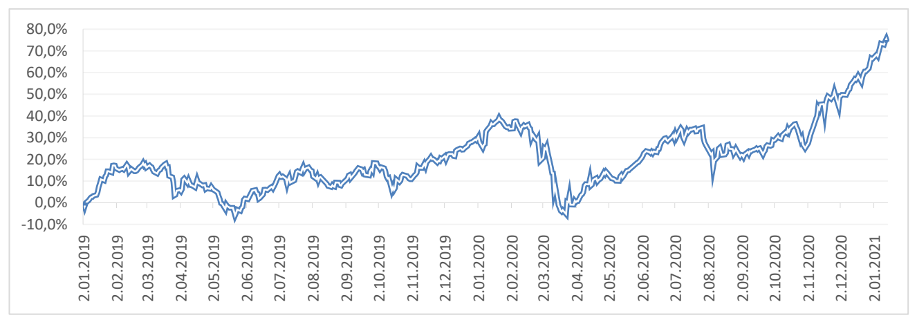
Figure 1: Cumulative change in BIST100 (January 2019-January 2021)

After the outbreak of the initial Covid-19 cases in March 2020, BIST 100 index depreciated appr. 40% during the month (Figure 1). The higher volatility after March 2020 is consistent with the expectation of the negative effect of the Covid-19 on the index. In addition, the stock index became more sensitive to the macro variables during this period. The drop in the index recovered after April onwards, but the index experienced a volatile trend in the following months. The lockdowns and their effects on the businesses lead to the volatility in the stock price performances during the period.