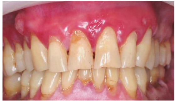
Figure 2. Erosive form