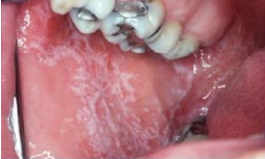
Figure 1. Reticular form

ROC curves were used to determine the most useful cut-off point for the diagnostic value of IL-6 (Figure5). The area under the curve (AUC) was 78.4% (P=0.001), which was acceptable for distinguishing OLP patients from healthy subjects. The cutoff point for IL-6 was set at 17.5 (sensitivity = 76.7% and specificity = 70%). PPV and NPV were calculated to be 72% and 75%, respectively (Table 2).