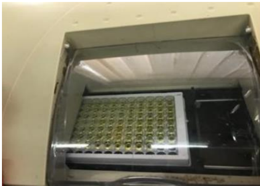
Figure 3. ELISA Plate Reader, in order to read the absorption of the wells