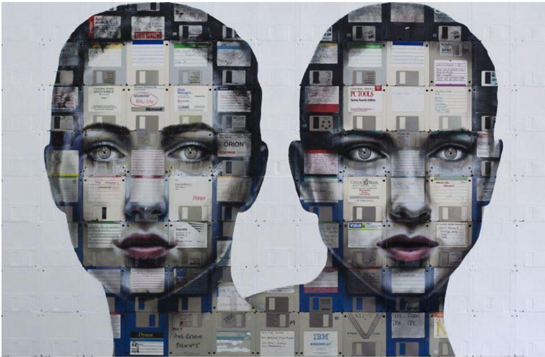
Image -8, Artist - Nick Gentry, [source of image - arte8lusso.net ]