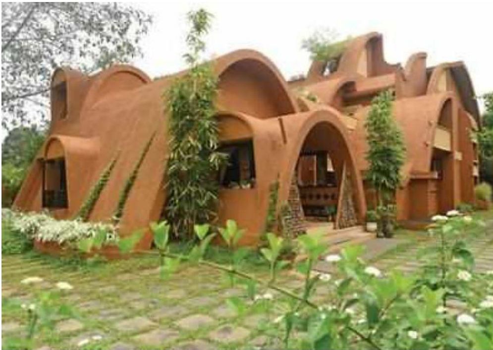
Image -3 , Mud House , Kerala

. Earth Is one of man's oldest building materials and most and share civilizations used in some form. It was easily available cheap and strong and required only simple Technology . In Egypt The Grain stores of Ramassume building built in Adobe in 1300 BC still exist ,the Great Wall of China has sections built in rammed earth over 2000 years ago . Iran ,India ,Nepal, Yemen all have examples of ancient cities and large buildings built in various forms of earthen Constructions. 5 History repeats itself nowadays. There is a craze for mud houses in hotels, restaurants , guesthouses , and for personal homes also . Kerala based Architect G Shankar mud house at Mudavanmugal in Thiruvananthapuram, is the eye catching 3000 square feet mud house near banks of Vellayani lake. 6 [image - 3 ]