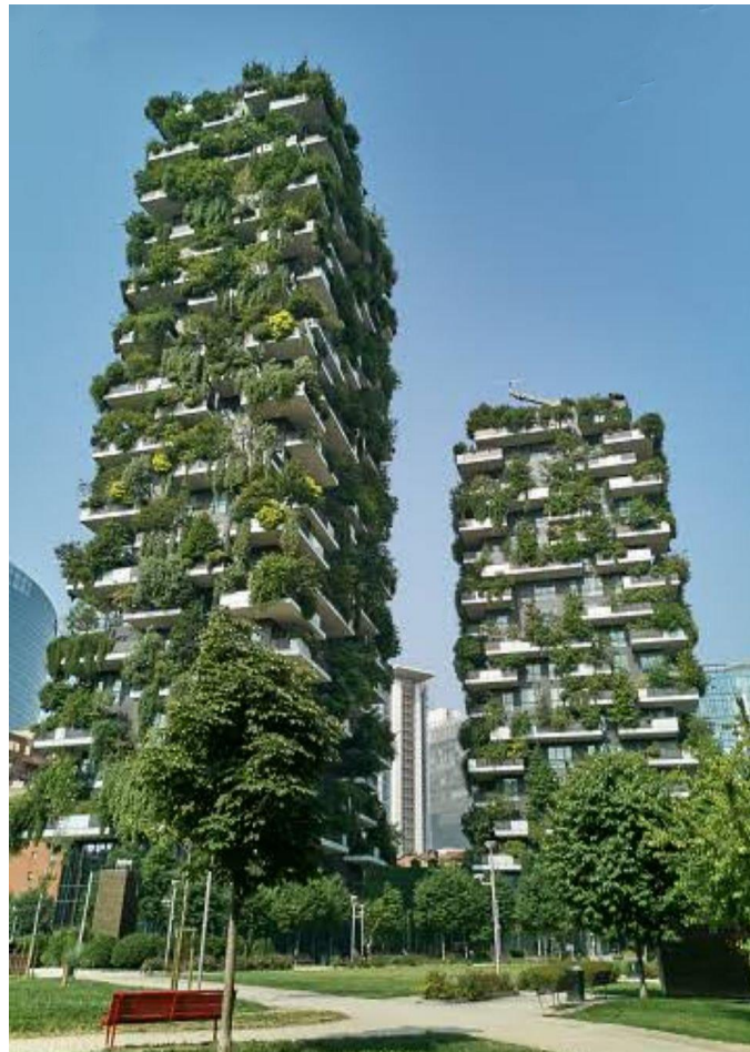
Image -2 , Bosco -Verticale -Milan [Italy], [image source - wikipedia -e net ]

The buildings biodiversity is expected to attract New birds and insect species to the city . It is also used to moderate temperatures in the buildings in the winter and summer by shading the interiors from the sun and blocking Harsh winds . The vegetation also protects the interior spaces from noise pollution and dust from street level traffic. The building itself is self-sufficient by using renewable energy from solar panels and filtered Waste water to sustain the building's plant life; these green technology systems reduce the overall waste and carbon footprint of the towers . [image -2 ]