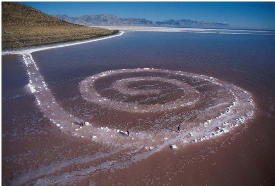
Image -5 , Land Art ,Spiral Jetty by Robert Smithson

The most prominent example of land art is Spiral Jetty. 8 Spiral jetty is an earthwork sculpture constructed in april 1970 that is considered to be the Robert smithson built on the North Eastern shore of the great salt lake near rosal point in Utah Entirely of mud salt , crystals, basalt rocks and water. Spiral Jetty forms a 460 meters wide counterclockwise coil jutting from the Shore of the lake . [image -5 ]