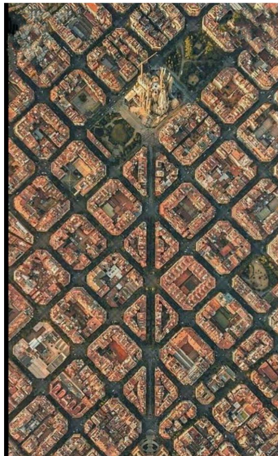
Image - 4 , Barcelona City - Spain

And second, his plan embodied what is - then and today- a striking egalitarianism . Each block [manzana] was to be of almost identical proportions, with buildings of regular height and spacing and preponderance of green space. Commerce was to take place on the ground floor , the bourgeoisie were to live on the floor above[ rather than mansions at the edge of town and the workers were slated for the upper floors . In this way they would all share the same streets and public spaces, exposed to the same hygienic conditions , reducing social distance and inequality . [ image - 4]