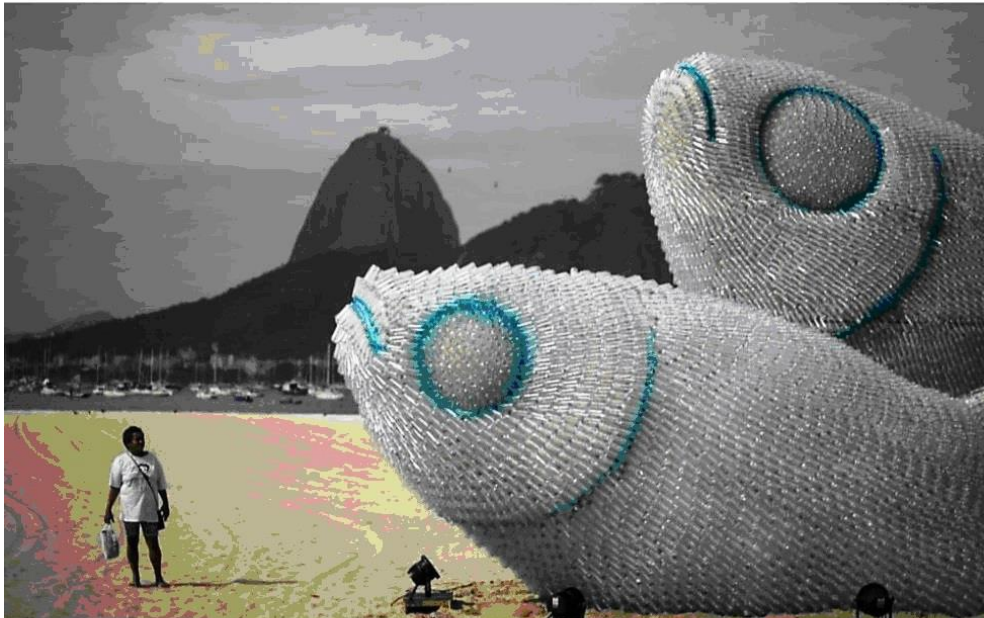
Fish installations from plastic bottles,

Andre Brossil [Ecofuturist Artist ]creating a unique piece of art, the spherical Sun power generator , is not just an artistic interpretation of renewable energy but it is also a renewable energy invention. The sculpture is a structure that generates twice the Normal amount of solar energy possible with the Solar Panel this also works using significantly less surface area we can use this invention to charge an electric car or serve as a high power lamp at night. 10 [image -7]