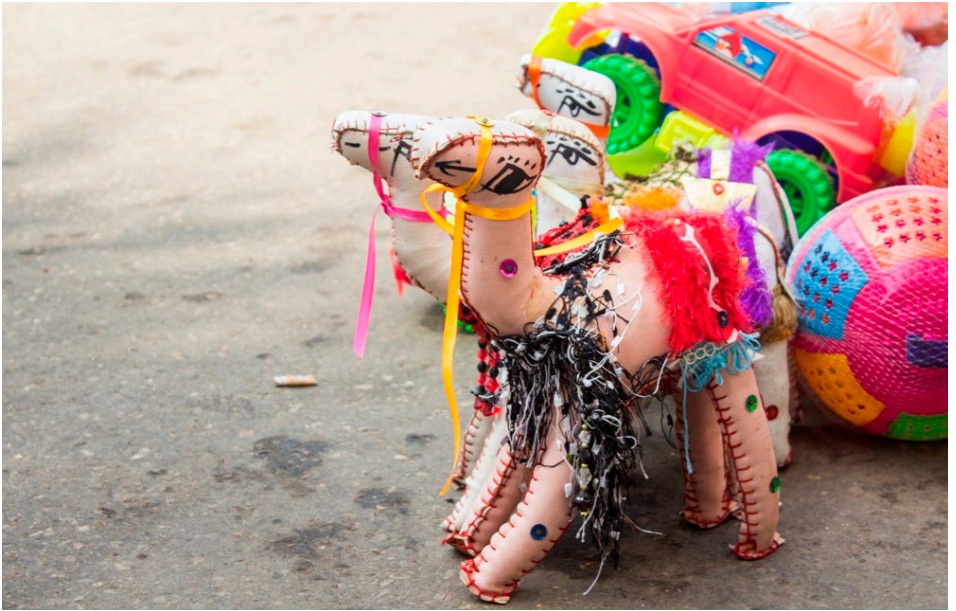
Figure 4. S.A.Helmy, 2016. Street Observation in front of Al-Hussein Mosque.