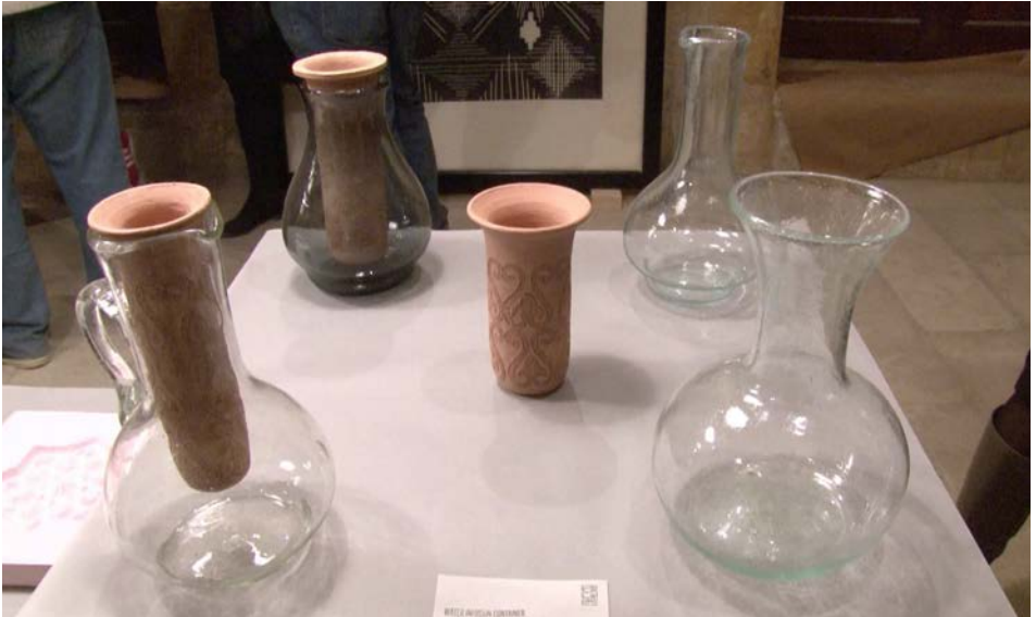
Figure 1. Media Production Centre GUC, 2016. Glass and pottery craft experimentation exhibited at El Maqaad in Qaietbay area.

Working with a local craftsman for glassblowing and the clay workshop of the university campus, the design proposal was a series of glass water jars with an intern corpus made of clay.