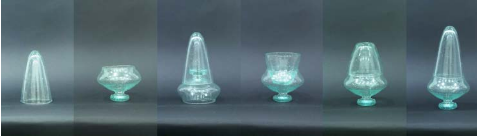
Figure 2. A.Sicklinger, 2016. Glass craft experimentation exhibited at El Maqaad in Qaietbay area.

Perforating the clay walls with Islamic patterns, the design concept followed both aims, aesthetical and functional, at the same time: matching the arabesque form of the glass jar and allowing the filtration of water with herbs and perfumed leaves. The outcome has been presented in an Exhibition called “Meeting with the Sultan” at the Maqaad, Sultan Qaytbey Area of the Eastern Cemetery in Cairo in December 2016 (Fig.1).