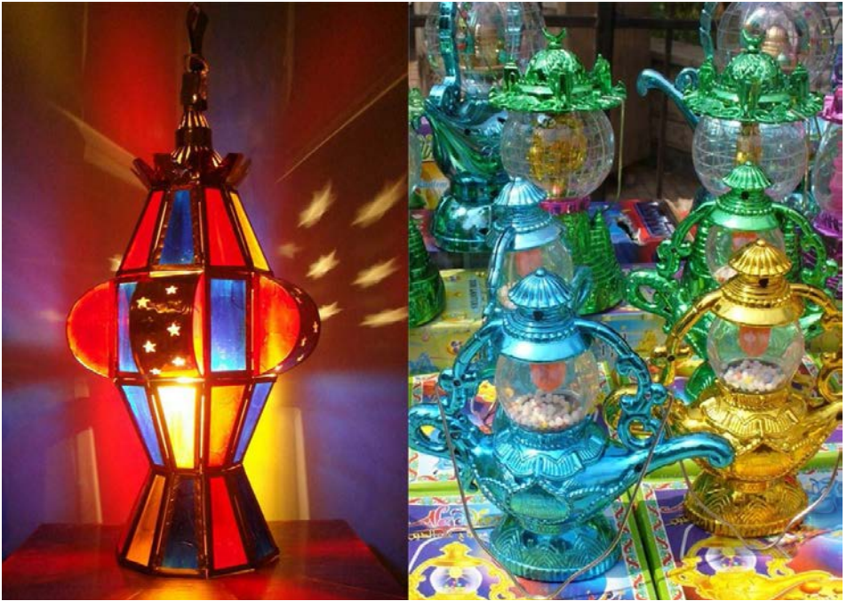
Figure 6. The Origins of the Ramadan lantern - Fanoos- of Egypt and Beyond, n.d. A comparison between the traditional fanoos and an example of the modern day fanoos.

This leads to complete loss of its aesthetical value and disintegration of public taste and culture (Fig.6). Relating such a phenomenon to how pollution is affecting our planet, one could argue that also in natural evolution, mutations into different species have been taking place over time, but one can't deny how nowadays pollution is causing global warming which is ultimately driving human kind, apex of this evolution, towards destruction. This example was inspiration and guide of the drives towards the concept that was developed for the third step of this research.