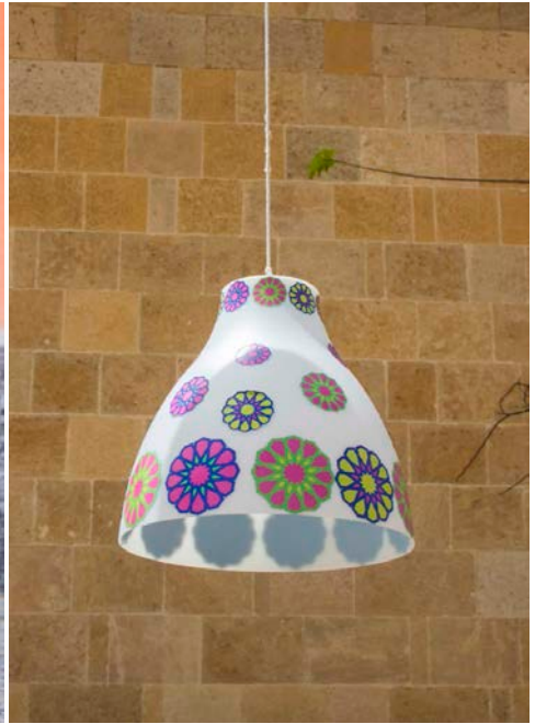
Figure 7. S.A.Helmy, 2016. The First lamp; Mishkah covered with “The Scream” painting. Figure 8. S.A.Helmy, 2016. The second lamp; Ikea’s Lamp covered with Islamic patterns.