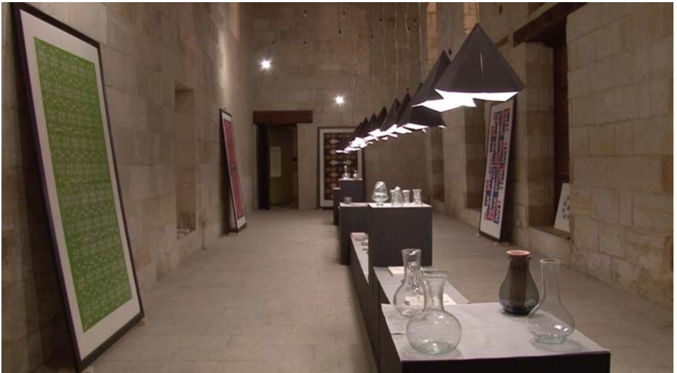
Figure 3. Media Production Centre GUC, 2016. “Meeting with the Sultan exhibition” El Maqaad in Qaietbay area.