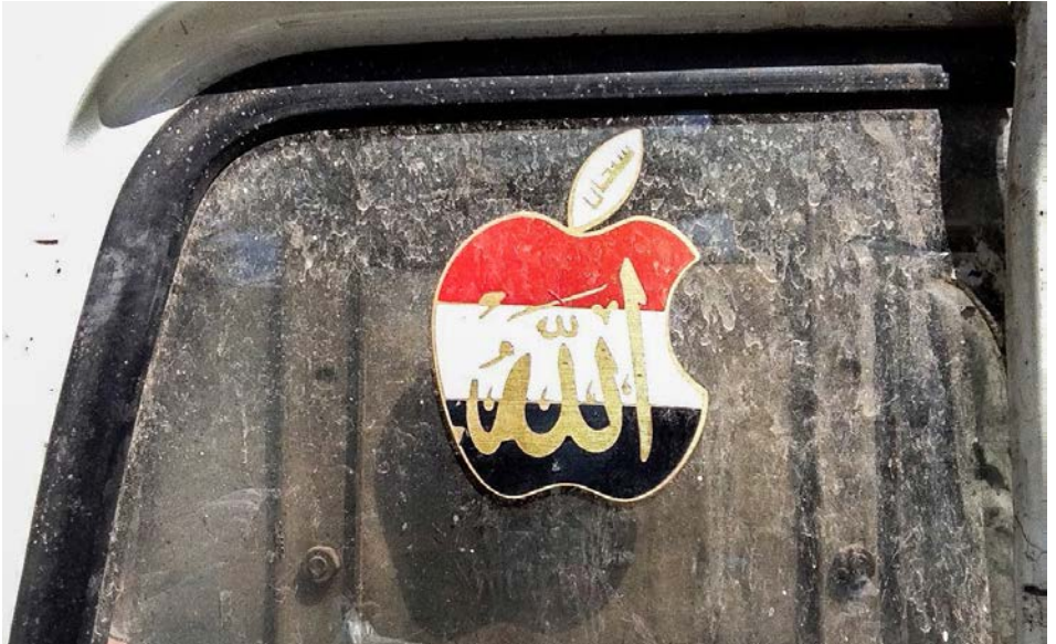
Figure 5. Elghary, 2017. Visual Trends in the streets of Egypt.