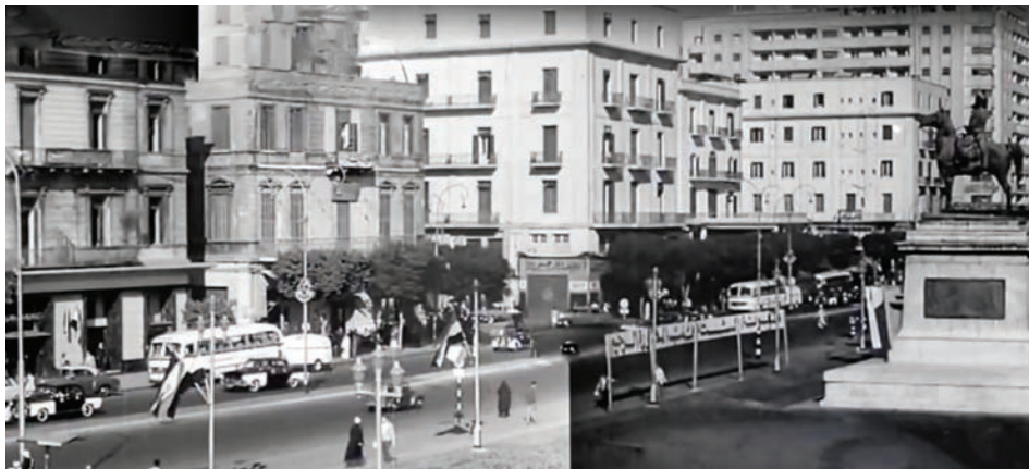
Figure 14. Stills captured from the film Youm Men Omri , 1961. The Continental (Ex-Savoy) Hotel is located to the right of the picture.