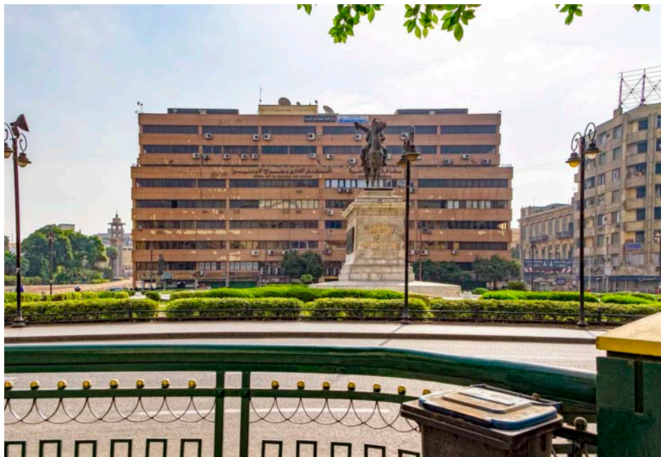
Figure 6. Current place of the former Khedival Opera House, Opera Square, 2017.