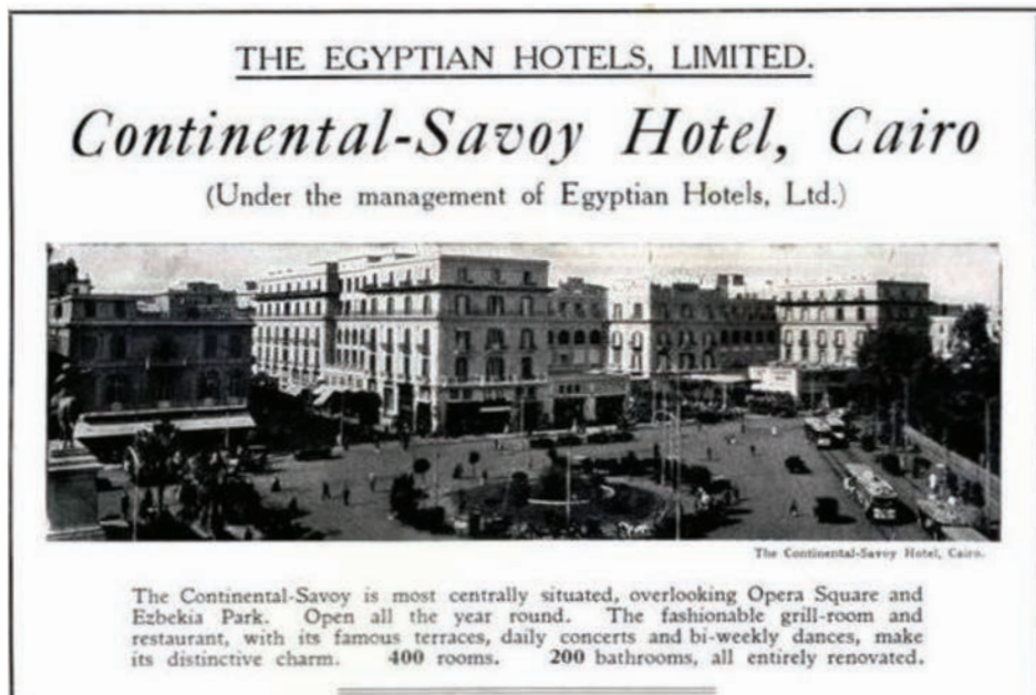
Figure 8. The Continental-Savoy Hotel Advertising, Cairo 1922. Ahsan Nas. "Continental-Savoy Hotel" March 20, 2011.

The Continental (previously known as Savoy) Hotel was one of the last historical extravagant hotels to withstand modern development in the Downtown Cairo area. Sadly, this building was demolished in early-2018. It is currently not known whether the hotel will be rebuilt, or whether it will make way for fresh development.