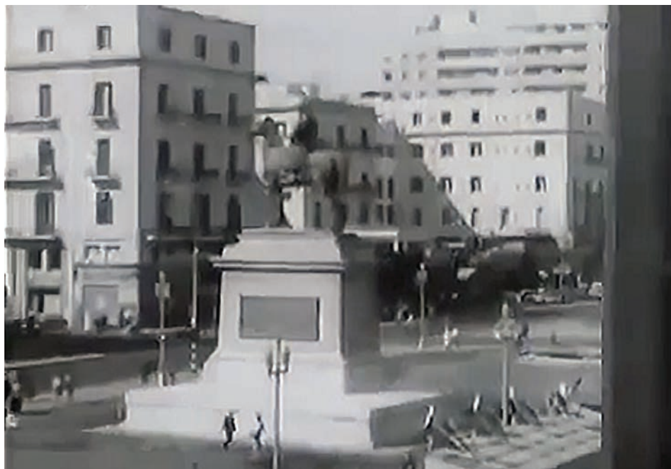
Figure 13. Still capture from the film Ehna el Talamza (1959). The Continental (Ex-Savoy) Hotel is depicted in the background.