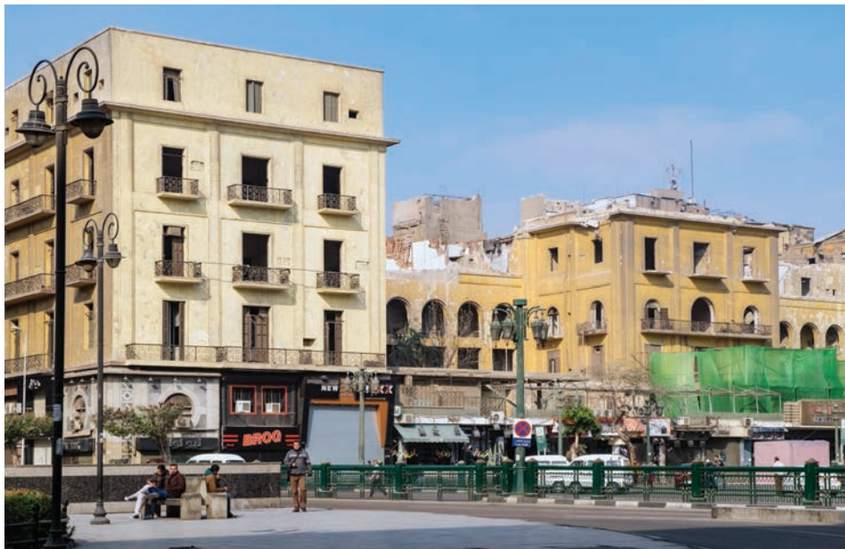
Figure 11. The Continental (Ex-Savoy) Hotel in 2018 whilst in the process of being destroyed, Opera Square (Cairo), 2018.