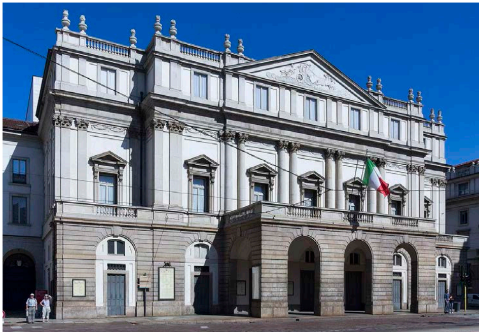
Figure 2. Jean-Christophe Benoist Scala De Milan, Italy [Image] (2011). Milan, Italy. Retrieved December 2017. https://en.wikipedia.org/wiki/La_Scala#/media/File:Milan_-_Scala_-_Facade.jpg .

Currently, the area it is located on is known as Opera Square after the Cairo Fire 1952 which caused a partial destruction of the Khedival Royal Opera House. The Opera Square as well as equestrian statue of Ibrahim Pasha which is also located on the square, appeared in a number of cinematographic films between the 1930s and 1960s; among others in the films Adl el Samaa عدل السماء [ Heaven's Justice ] in 1948, in Maaboudet el Gamahir معبودة الجماهير [ The People's Diva ] in 1967, and in Akhtar Ragol fel Alam أخطر رجل في العالم [ Most Dangerous Man in the World ] also released in 1967. These movies and a small number of archived photographs are the only records which reference this area and how it looked during the past.