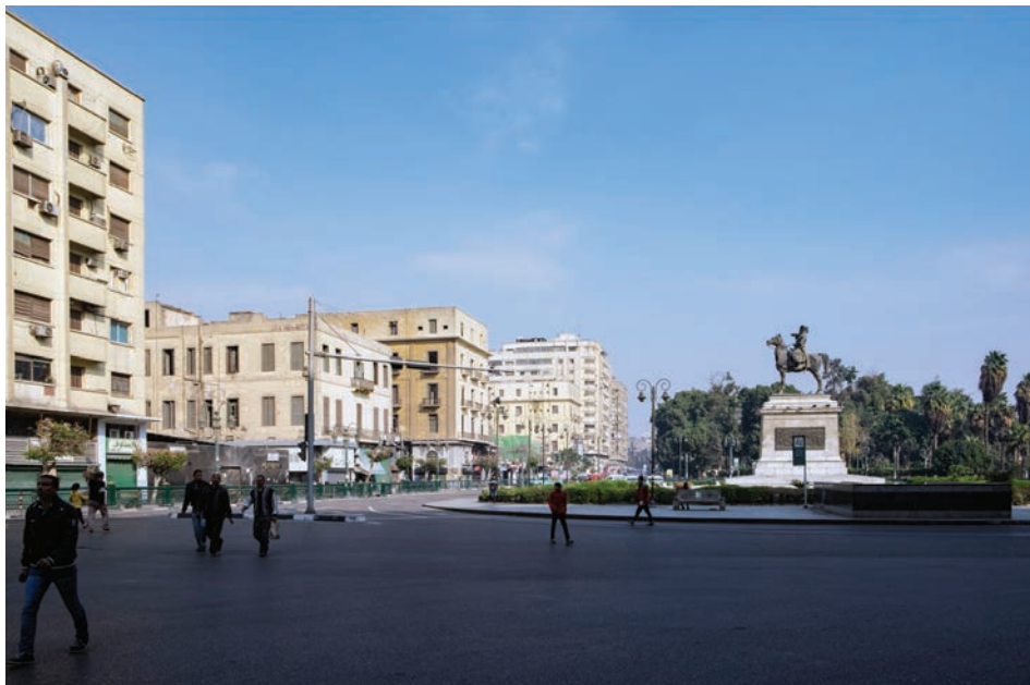
Figure 15. The Continental (ex-Savoy) Hotel during the demolishing process.