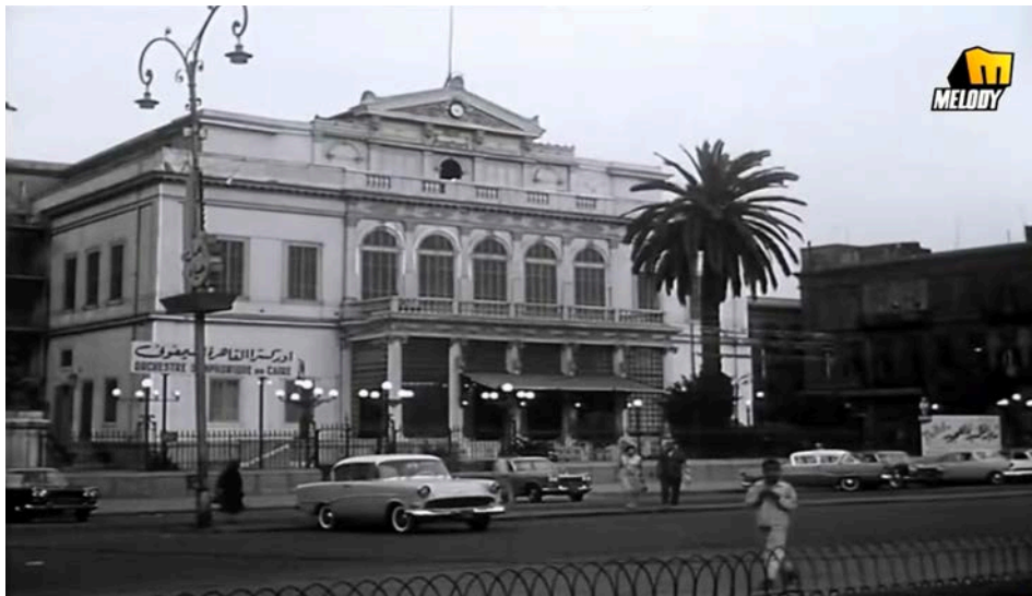
Figure 3. Khedival Opera House.