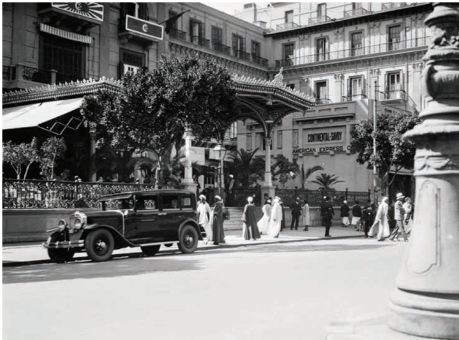
Figure 9. The Continental-Savoy Hotel Main Entrance, Opera Square 1934, Egyptian Hotels, Ltd, Cairo.

Following figures, (Fig. 4 and Fig. 5), depict the Continental Savoy and the state the structure was in before being demolished in 2018. Re-photography is invaluable as it records historical buildings in their existing form. In addition, it highlights the unconsidered and hasty entry of commercial establishments into Cairo's downtown district. This phenomenon is illustrated by means of contrasting (Fig. 8) with (Fig. 11).