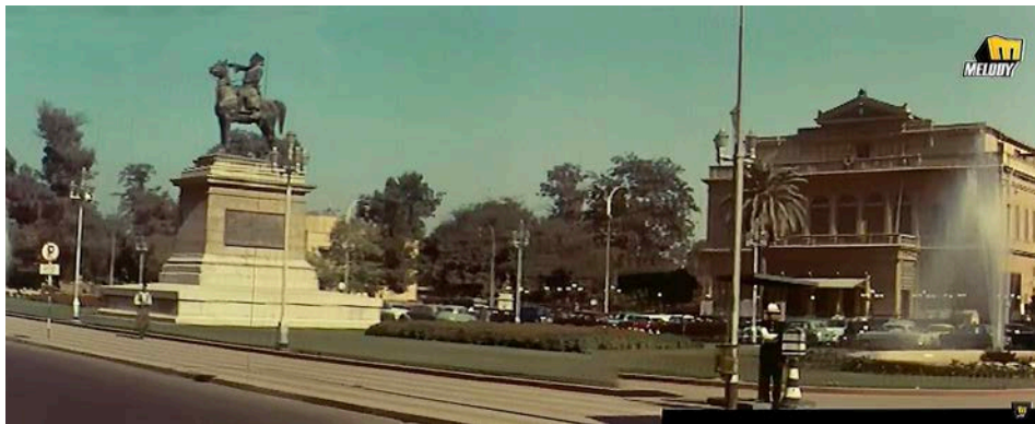
Figure 5. Khedival Opera House photo-merge of stills captured from Dalila Movie, 1956.

A number of the previously remarked upon buildings in Downtown Cairo had been demolished or burnt-down. Much of Cairo's architectural heritage disappeared. As per Wahba, Bahgat, & Saleh (n.d.) "Despite the legislation protecting these buildings from demolition and alterations, the public awareness to nineteenth and twentieth century architecture is still not fully formed and certainly maintenance laws were not respected." In 1971 the Khedival Opera House tragically burned to ground level and only some photographs and postcards survive to preserve the memory of its glorious past. The current Opera House located on Gezira Island in Zamalek in the vicinity of Downtown Cairo was inaugurated in 1988 by former Egyptian president Husni Mubarak twenty years after the original building was destroyed. The design and function of the current day Opera House differs entirely from that of its predecessor. The site of the original Khedival Opera House is now occupied by a multi-story car park. The history of the former Khedival Opera House is recalled in a display housed in a small room at the modern Opera House, and on the Opera House website.