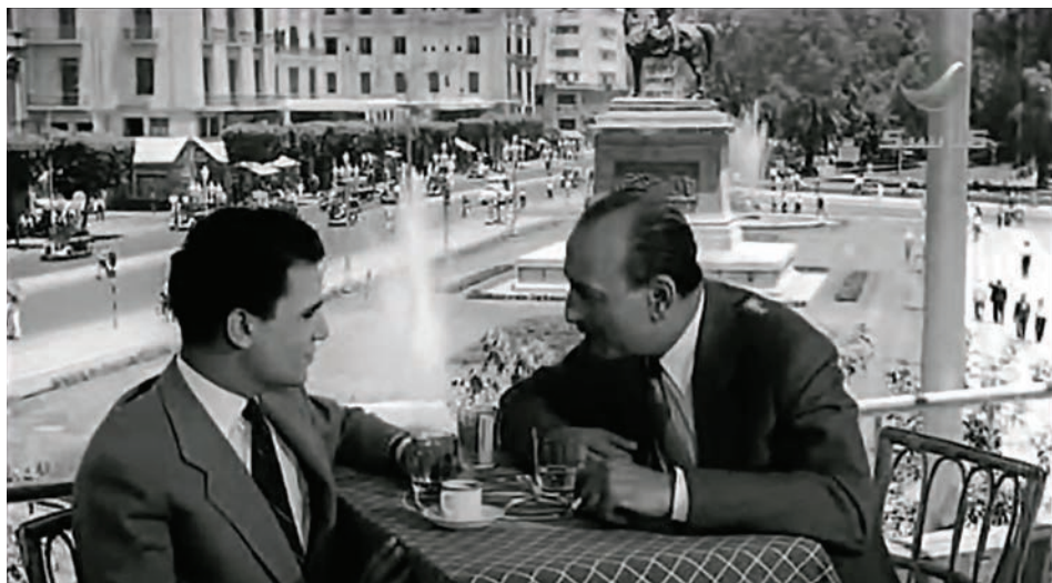
Figure 12. Still capture from the film Ayam w Layali (1955). The Continental (Ex-Savoy) Hotel, located on Opera Square in Cairo, is shown in the background.