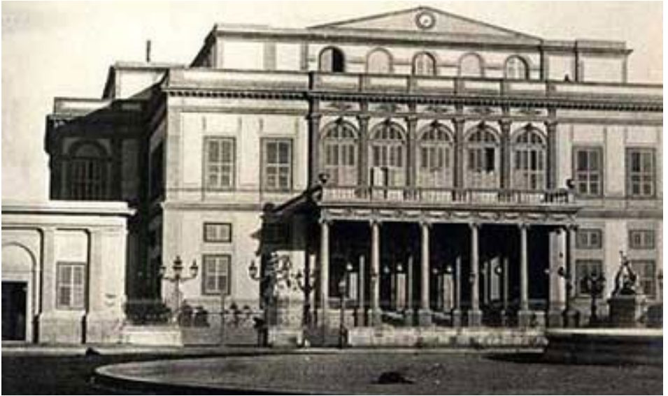
Figure 1. Khedival Opera House.

Experienced theatre construction architects Pietro Avoscani (1816-1891) was consulted and invited to Egypt to design the first Khedival Royal Opera House (Volait 2001, p. 93). The Khedival Royal Opera House, which is located in the el-Az-bakeya district, was built on the occasion of the inauguration of the Suez Canal in 1869 as a small-scale replica of the renowned La Scala Opera House in Milan.