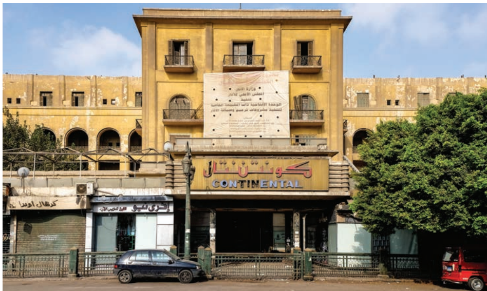
Figure 10. Main entrance of the Continental (Ex-Savoy) Hotel in 2017, before being demolished in 2018. Opera Square, Cairo. Photo: Nora Nabil Kahil, 2017.