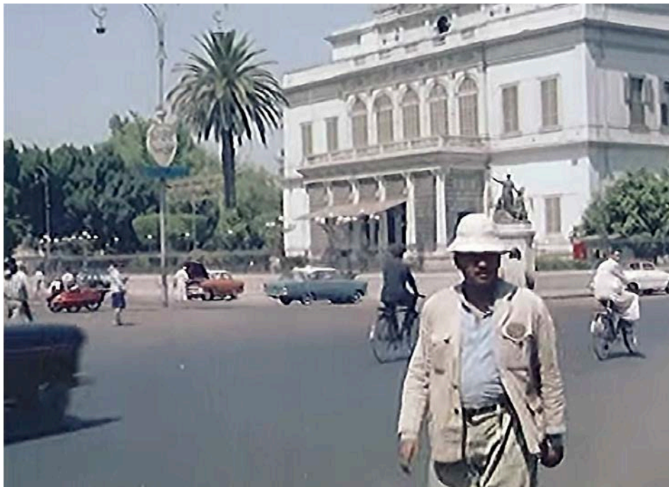
Figure 4. Khedival Opera House.