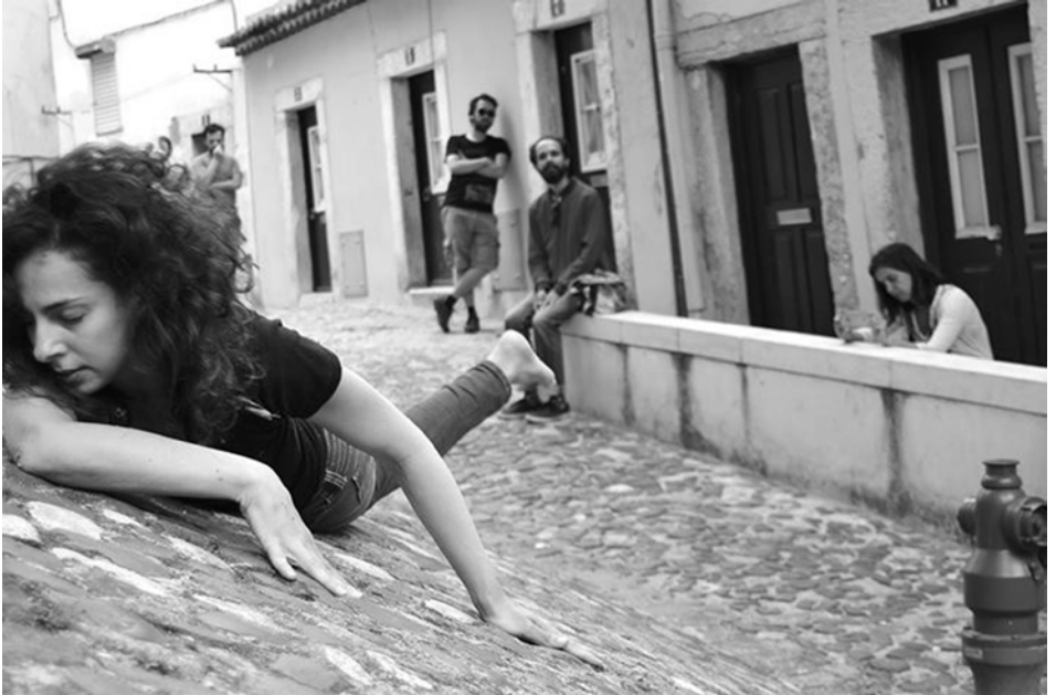
Figures 6. Investigation process of BICHO at Beco do Jasmim: footwork in the landform.

experienced the daily routine of being at Beco do Jasmim in state of dance, the body itself revealed the procedures to be tried out. The questions were made from the whole body to the whole body, and not from the mind to the rest of the body. This listening approach is decisive when one of the main concerns is to move-with the space, and not over it, resulting in a very specific experience that is not only aesthetic, but ethic and therefore, political.