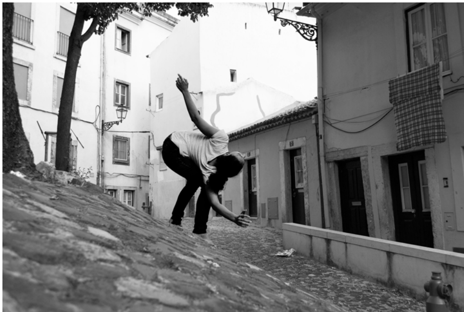
Figures 2-3. Investigation process of BICHO at Beco do Jasmim.