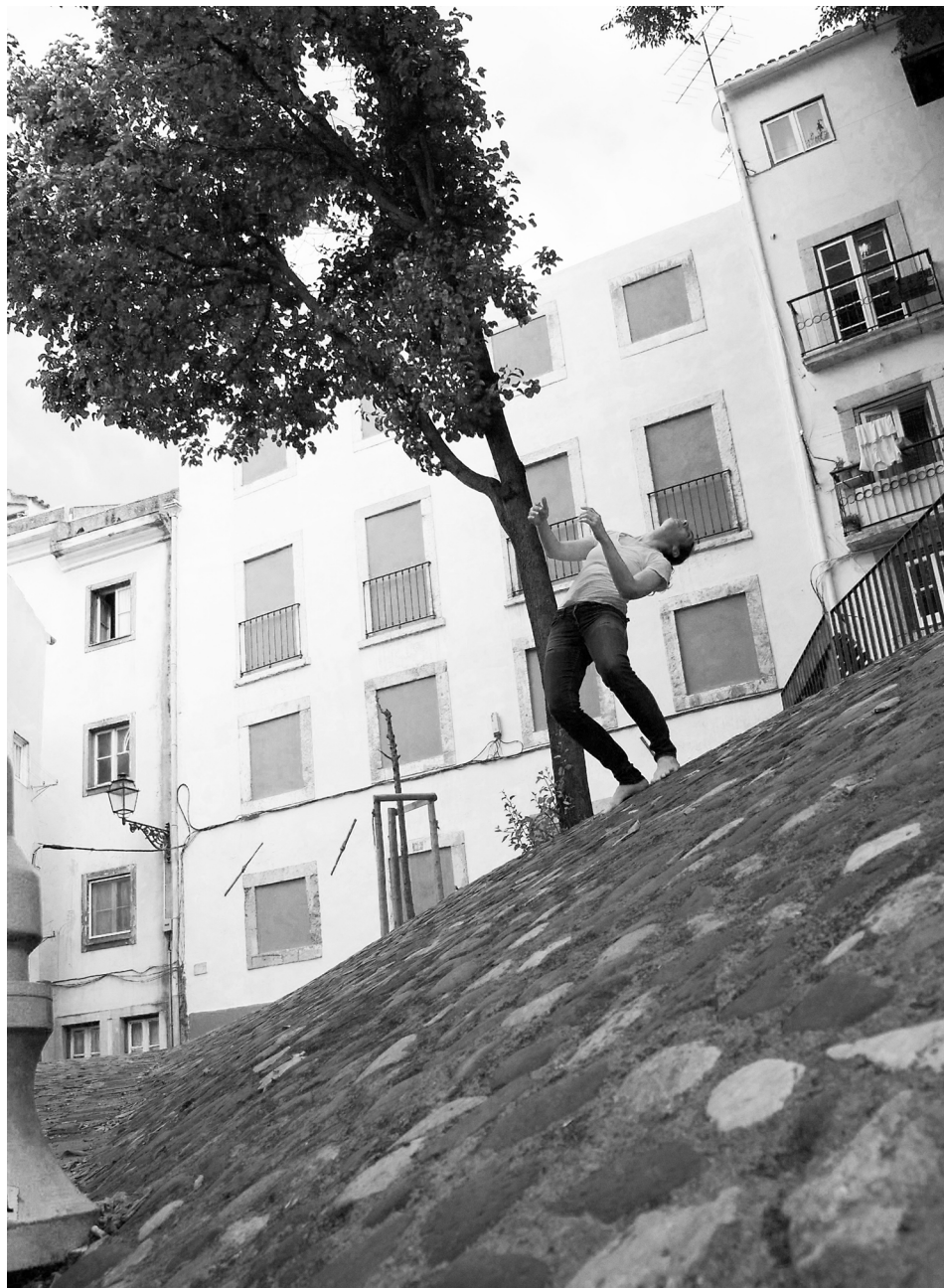
Figure 1. Investigation process of BICHO at Beco do Jasmim.