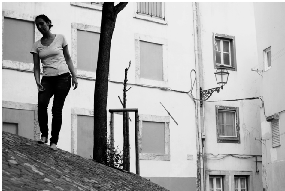
Figures 4-5. Investigation process of BICHO at Beco do Jasmim.