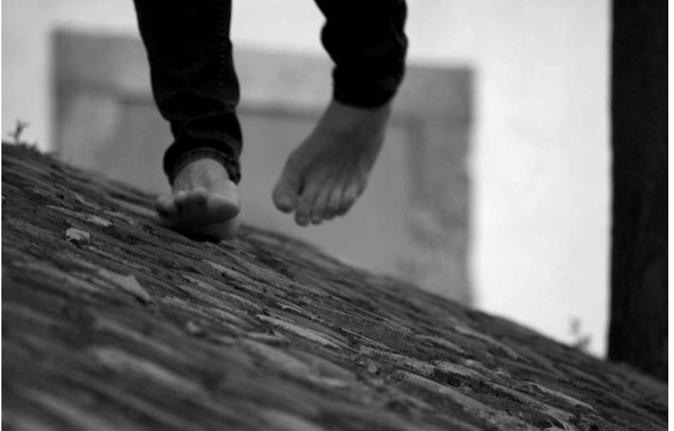
Figures 7. Dancing BICHO at Festival Pedras'18 - Em que mundo queremos viver?, july-2018, Beco do Jasmim - Lisbon-PT.

Composing BICHO was never a goal to achieve, because it always showed itself as a consequence of the physicality that was created with the daily practice at the studio of c.e.m and at Beco do Jasmim. The body invents itself in the contact with others. This will always a matter to pursue.