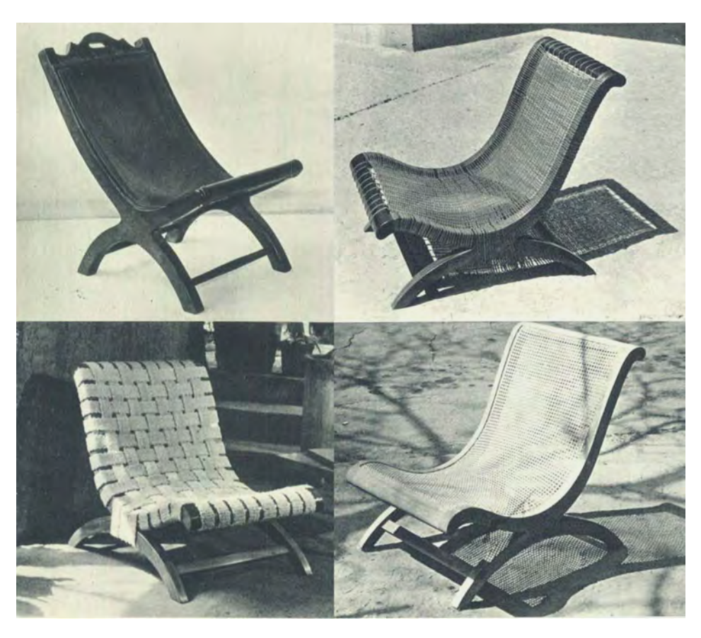
Figure 3. Clara Porset, Butaque, traditional version (see first photo above left) and modern version of Porset, Domus , 281, April 1953, 50-51.

Moreover, she selected mainly rustic and natural materials for its furniture, associated with rural life in Mexico. She asserted that the use of materials such as "palm, tulle weaves, Mexican pine and red cedar wood provided a further psychological affinity between inhabitant and furnishings due to the regional Mexican character they have" (Sheppard, 2015). Porset hoped that the result of this combined effort would satisfy in a coherent object both the human need for function