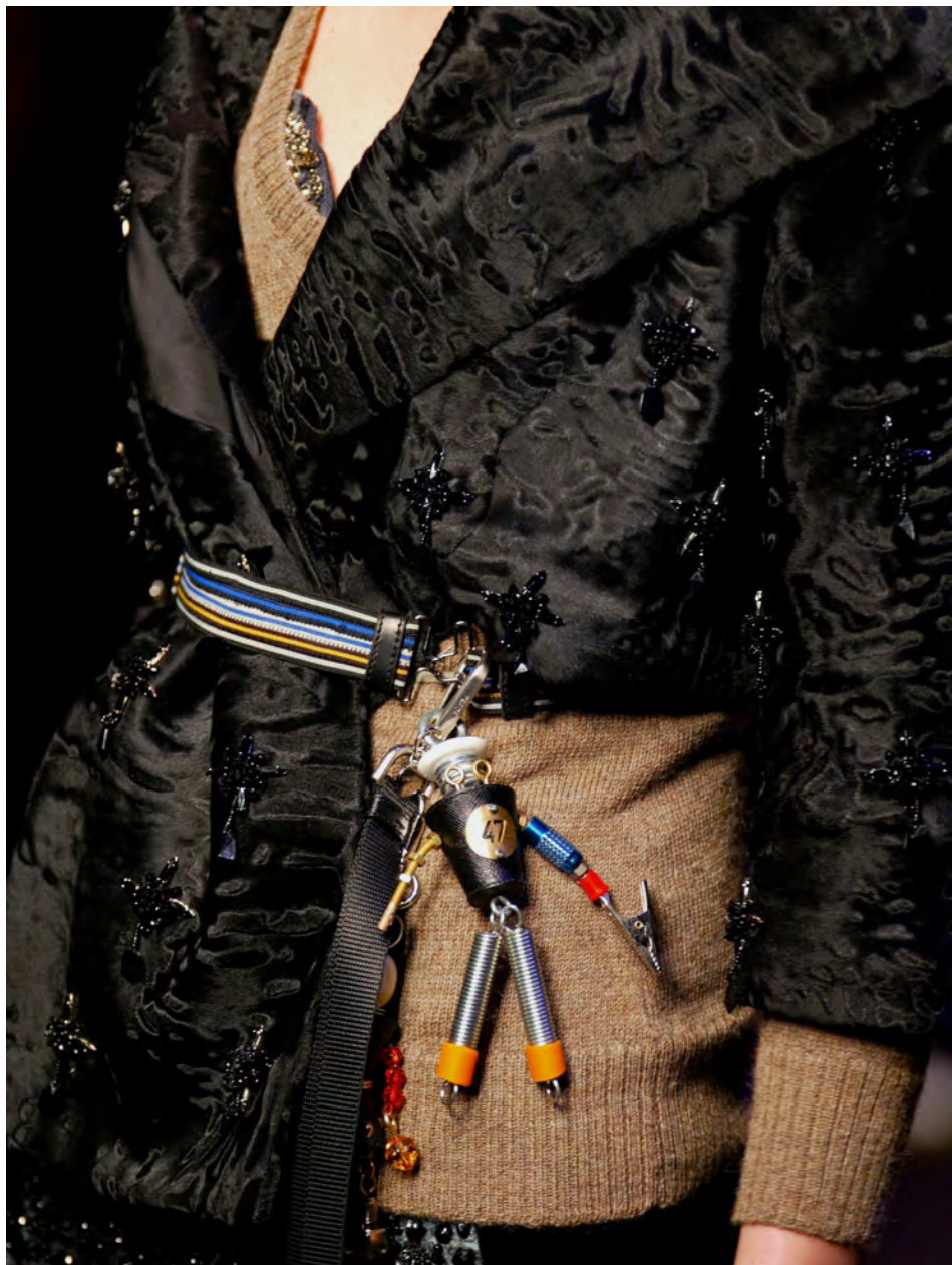
Figure 5. Prada, Autumn/Winter 2004–2005 women collection. A detail of the material mix of furs, embroidery, men’s fabrics, knitwear and bolts.