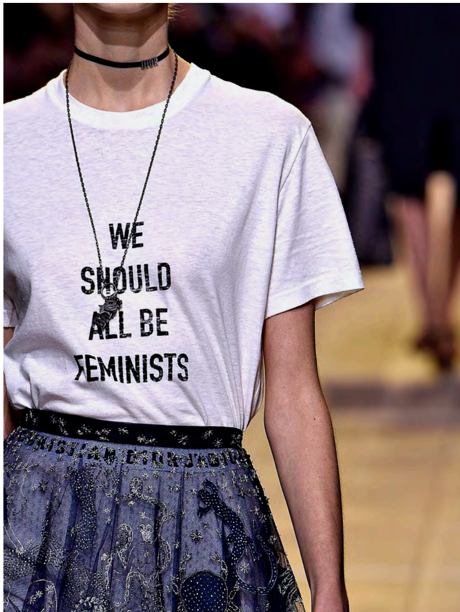
Figure 8. Spring/Summer 2017. The T-shirt “We Should All Be Feminists” shown by Maria Grazia Chiuri during her first collection.