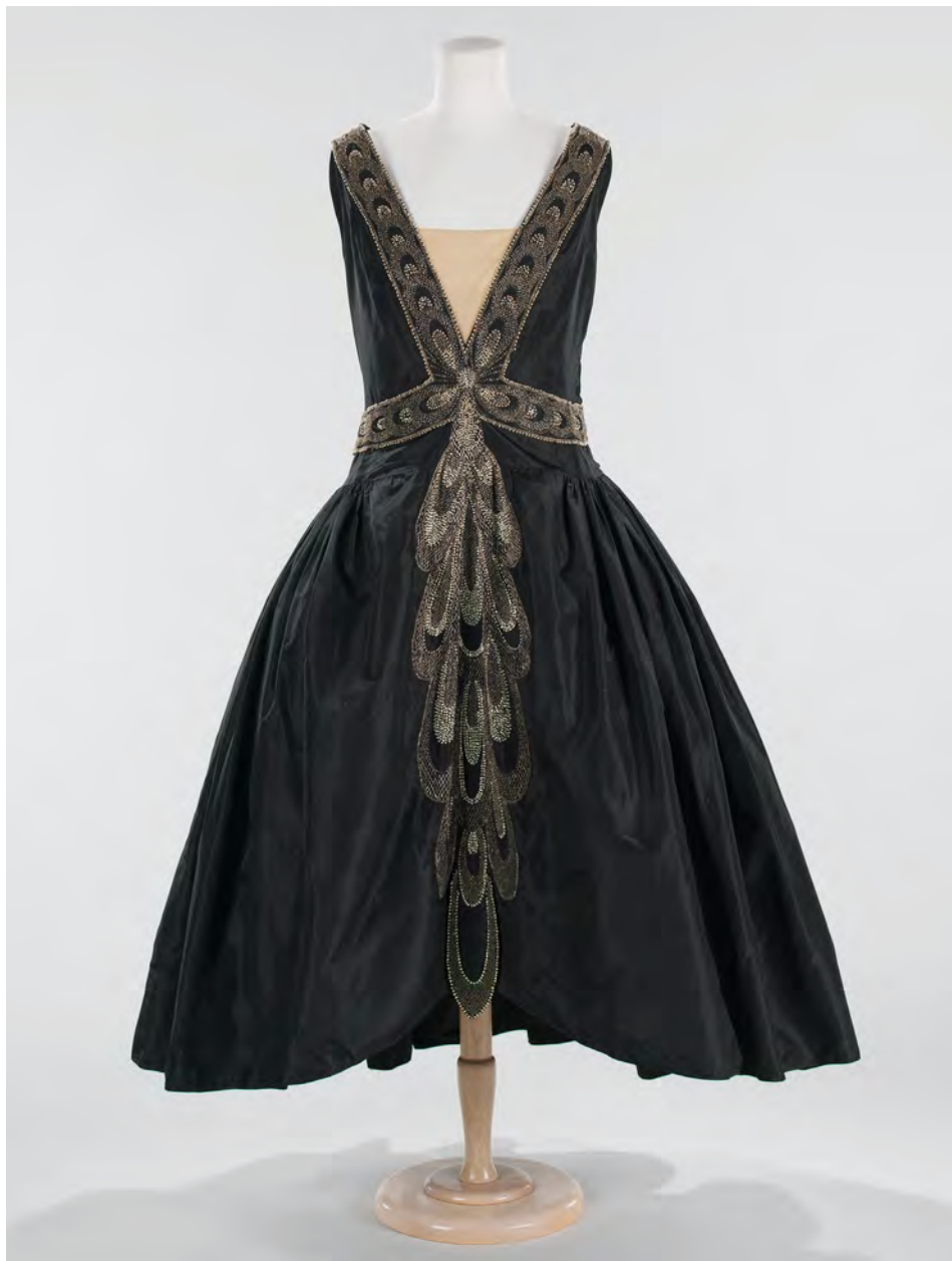
Figure 1. House of Lanvin, Robe de Style , Autumn/Winter 1926, silk, rhinestones, pearls.