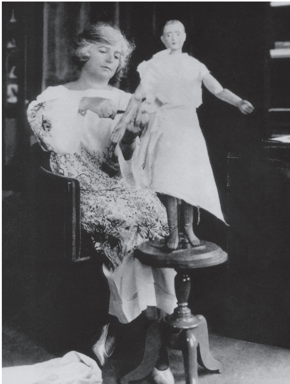
Figure 2. Madeleine Vionnet used a wooden dummy to create her fashion designs, 1930 c.