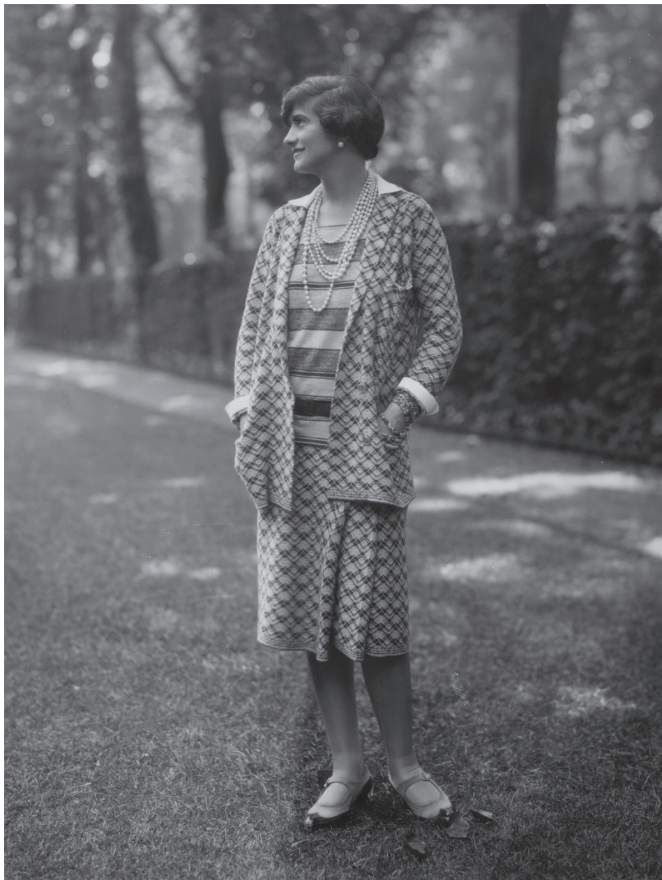
Figure 3. Gabrielle “Coco” Chanel wearing one of her suits in the grounds at Faubourg Saint-Honoré, Paris, 1929.