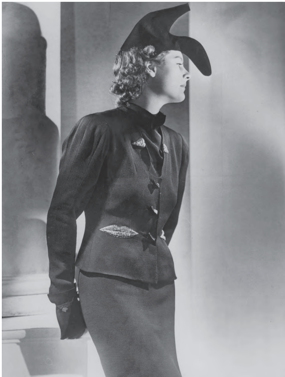
Figure 4. Elsa Schiaparelli, Hat shaped like a shoe , and masculine jacket with an applique in the form of lips, 1937.