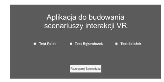
Fig. 6. The main panel layout

That an administrator/examiner decides which ones should be passed by the tested user.