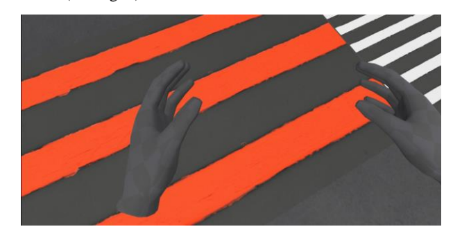
Fig. 4. The wrong cross of a forklift communication path

The third type of mechanics which could be added to the scenario is a passive mechanics, where a student has to remember about his own safety. This mechanic continues from the test beginning to its end, and the user has to keep careful and remember about necessity of the safety path, because at the same warehouse there are many forklifts and the workers cannot walk everywhere - it is too dangerous. If the mechanic is added to the test, the task consists of paths / communication routes that are used by forklifts to move the loads. The safety paths are marked by thin white stripes in the places where the examiner's entry is safe and withe the wide ones in the places where his move means an error (see Fig. 4).