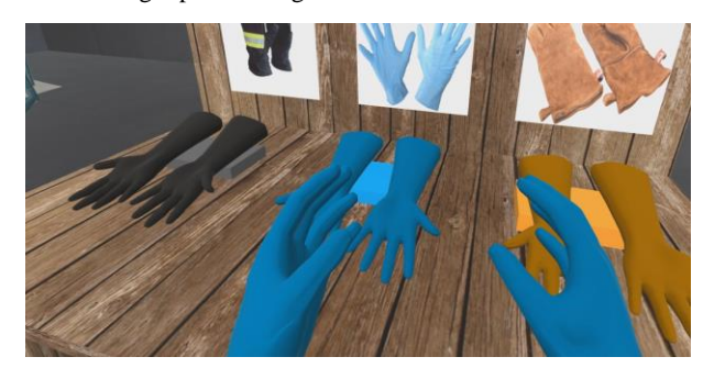
Fig. 3. The appropriate gloves used to a cleaning test

The second type of mechanics which could be added to the scenario is the task in which a student has to choose the appropriate gloves for cleaning the workplace. There are sharp objects there - broken glass, so before starting work, he has to choose the right protective gloves for this task.