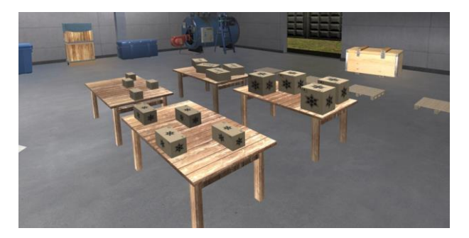
Fig. 1. The products confection task

The first task for the player is to proper stack boxes onto appropriate pallets within a specified time and according to an order. Here any mistakes could results with wrong customers' orders confection and future reclamations or could results in the products damage if the boxes will not be fitted correctly.