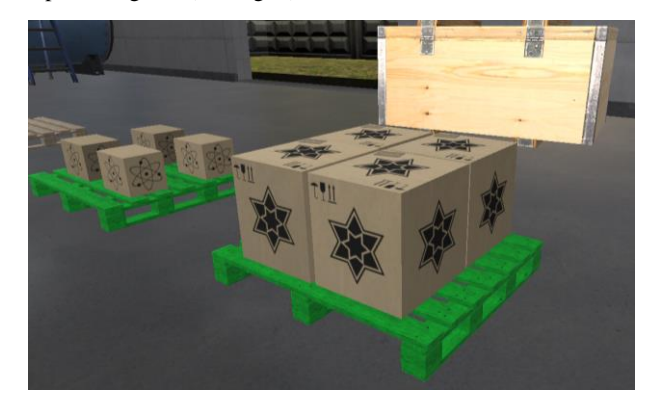
Fig. 2. The proper result of a task

After the task start, the student "physically" grabs the boxes and moves them to the appropriate pallet, he use two controllers (see Fig. 7). When the box is on the appropriate pallet and it is stable (i.e. standing still), he can starts to load the next one. After the proper boxes arranging on a given pallet, the VR mechanic will show him the correct completion of the task by sublighting the pallet in green (see Fig. 2).