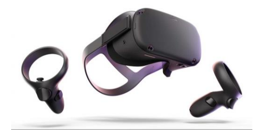
Fig. 7. Oculus layout

The native operating environment of this model of goggles are the internal peripherals of the device itself (built-in components that allow you to run the application without the need for any external hardware), but thanks to the Oculus Link technology [15] In the case of cable connection with a computer, the goggles can use its computing power to more advanced applications. The prepared solution assumes the use of this option.