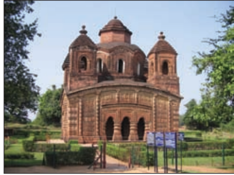
Figure 4. Shyamrai Temple

tower) shrine (Figure 3). According to inscriptional records, the Malla ruler, King Durjana Singha built this temple in 1694 AD. It has been constructed on a large plinth of laterite. The temple is much known for the exquisitely adorned walls and ornamental bricks. This temple consists of a single tower on a square sloping roof evidently symbolising the Bengal style of architecture. The facade contains magnificent carvings on terracotta plaques which depict epic stories and Puranic tales episodes from Krishnalila as main theme (Biswas 1992: 17)