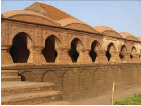
Figure 5. Rasmancha