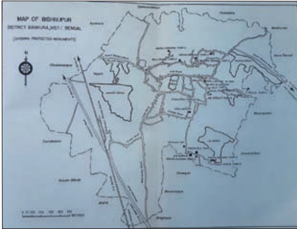
Figure 1. Map showing the temple sites in Bishnupur

hut with one or more chalas (roof) which resemble a typical Bengal folk hut (Nanda 2005: 64).