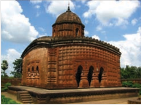
Figure 3. Madan Mohan Temple