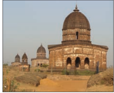
Figure 6. Jormandir Temple