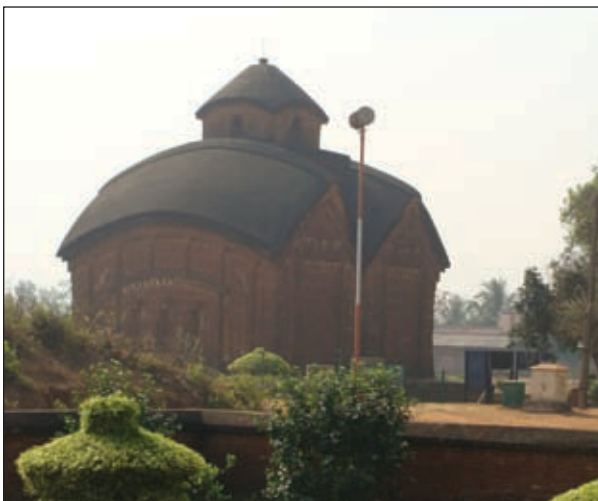
Figure 2. Jor Bangla Temple

The twin hut shaped temple structure built of carved bricks represents typical Bengal type of folk architecture, joined together by a small tower on the top (Figure 2). This terracotta temple is intensely carved with terracotta plaques depicting