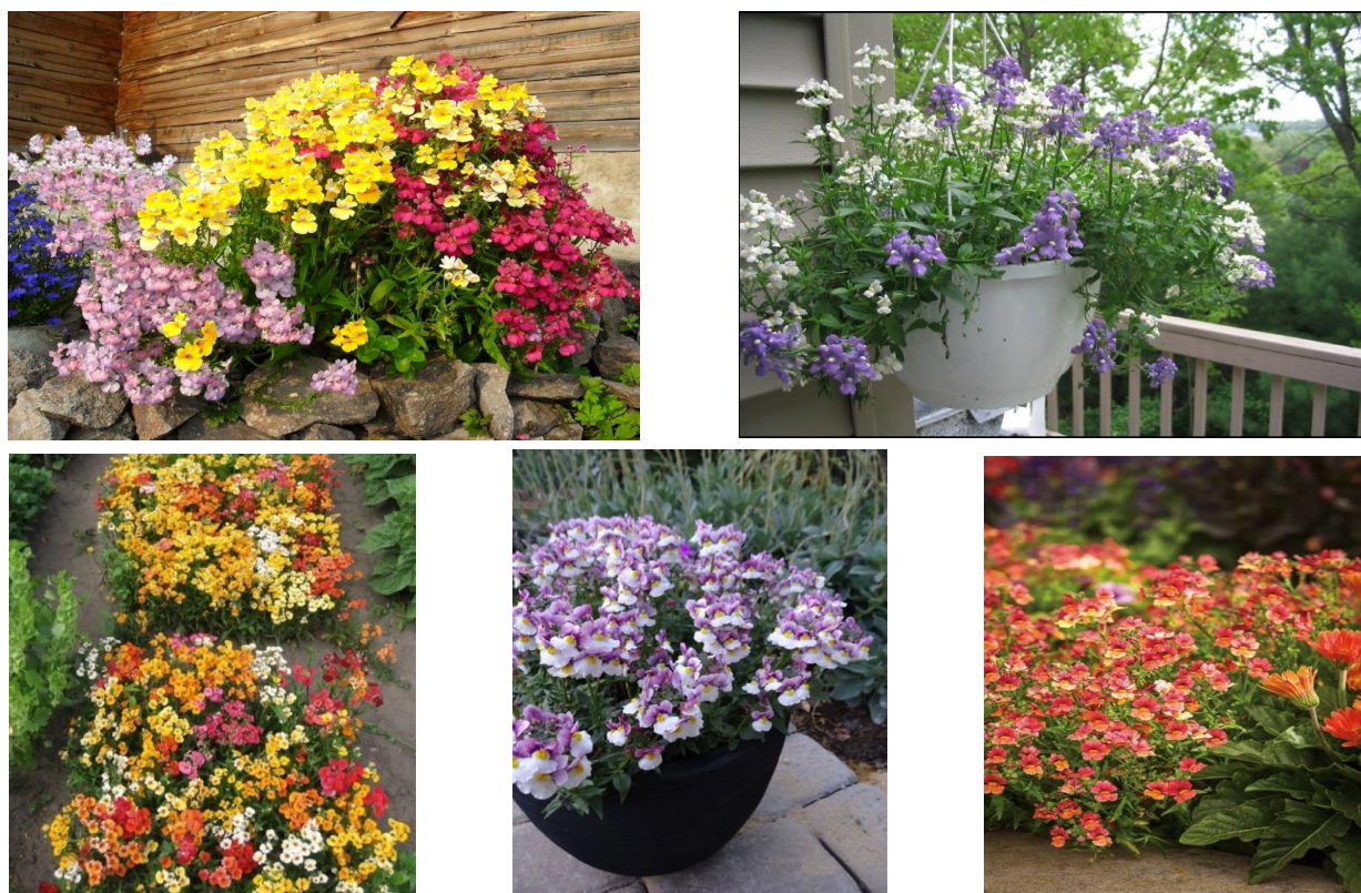
Figure 2. The use for landscaping health complexes, recreation areas, offices, and adjacent territories