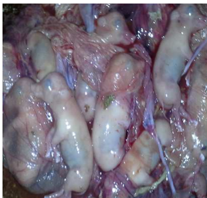
Figure 3: Fetuses in first trimester