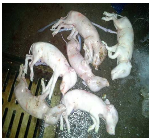
Figure 5: Fetuses in third trimester

Again, there is a positive correlation between fetal losses and the number of sows slaughtered. The lack of enforcement of legislation against slaughtering of pregnant pigs could be as a result of inadequate veterinary officers attached to the abattoir which often lead to the high incidence of slaughtering of pregnant sows which accounted for the high