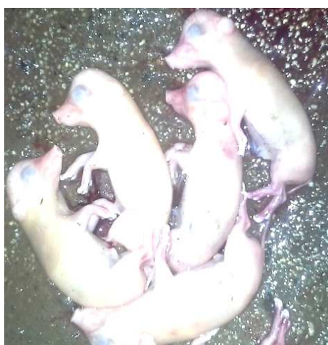
Figure 4: Fetuses in second trimester