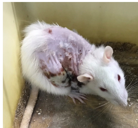
Fig. 2. The characteristic position of the experimental animal of the control group on the 3 rd day of observation

position of the body in the animals of the control group and main group 1 with curved torso towards the injury, bowed head and cautious behavior when moving, which suggests significant pain at the site of injury, was determined.