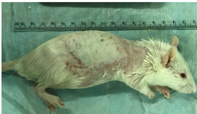
Fig. 1. Wound appearance of the animal in the control group on the 1 st day of experimental modeling, the formation of burn necrosis

On the first day the formation of gray burn necrosis in the injured area with islets of shading was determined in animals of all groups. Size of the islets increased in proportion to the decrease in neutralization time, mostly in the control group (fig. 1).