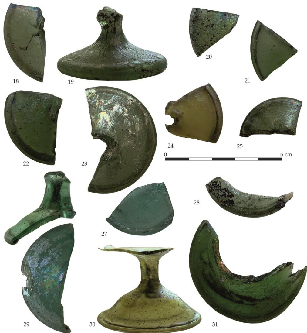
Fig. 4. Fragmentary stemmed goblets from the Acropolis Centre-South Sector (Histria).