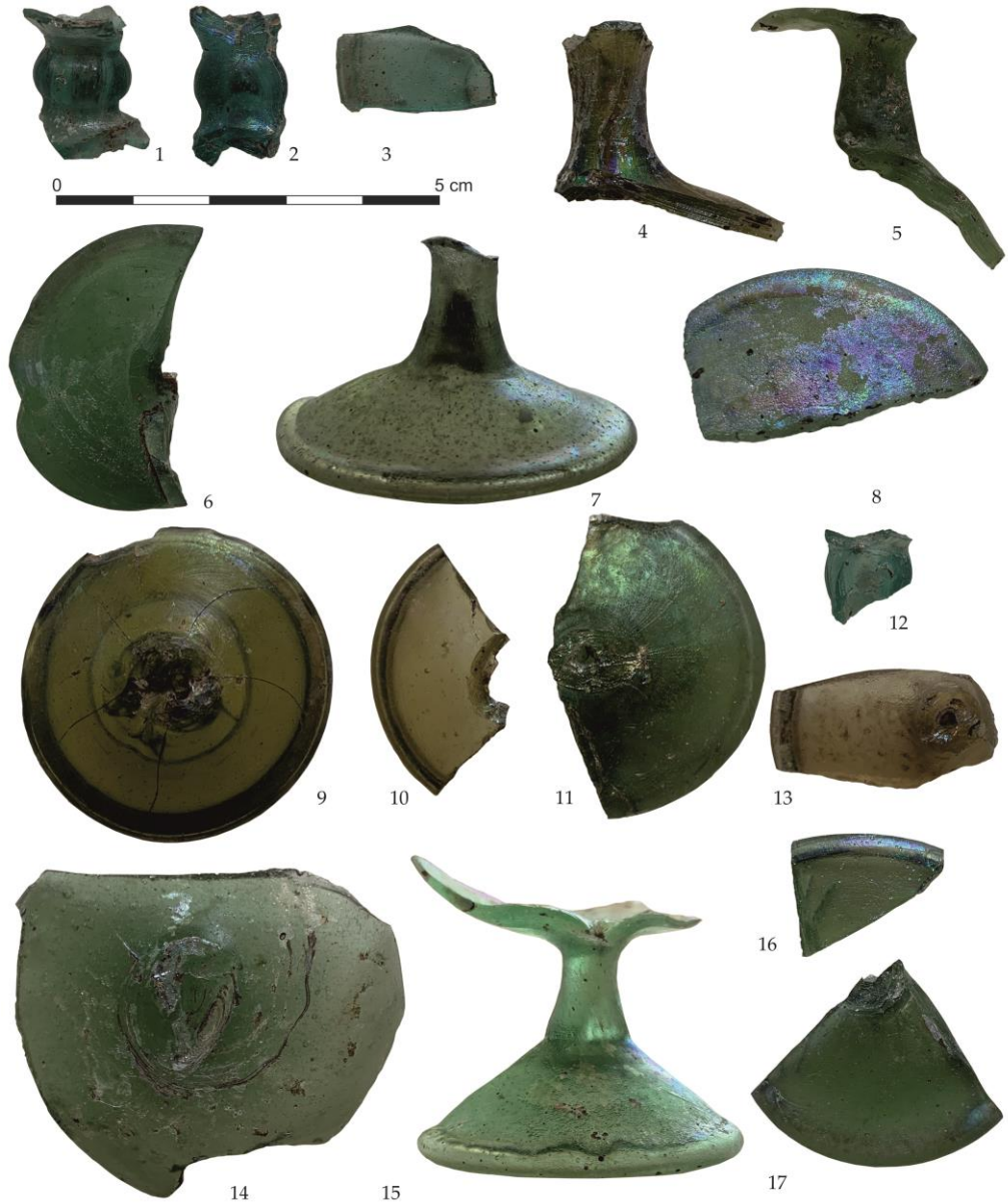
Fig. 3. Fragmentary stemmed goblets from the Acropolis Centre-South Sector (Histria).