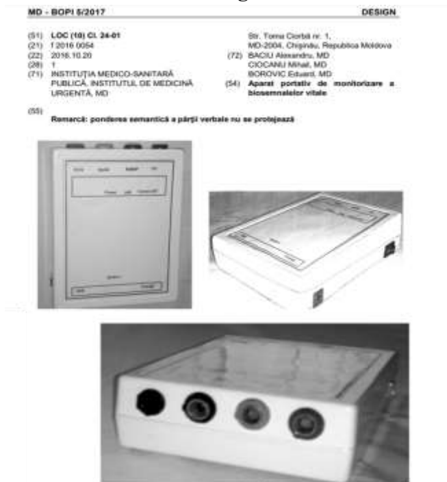
Figure 4. An industrial design of the portable monitoring device of vital bio signals

An example from 2017 BOPI magazine is a portable monitoring device of vital bio signals (AGEPI, 2017, p. 126) (Figure 4).