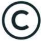
Figure 5. A copyright mark and an example on the printed Abstract book for the PhD theses