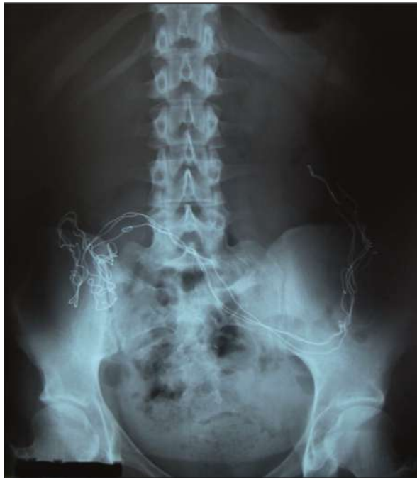
Figure 2. Plain abdominal X-ray of the patient with gossypiboma.