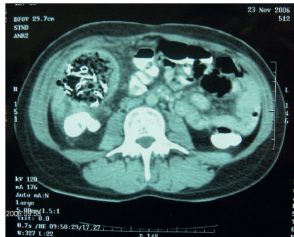
Figure 1. The typical appearance of a complex mass containing air bubbles and radiopaque markers.

Mots-clés: corps étrangers, gossypibome, éponges chirurgicales.