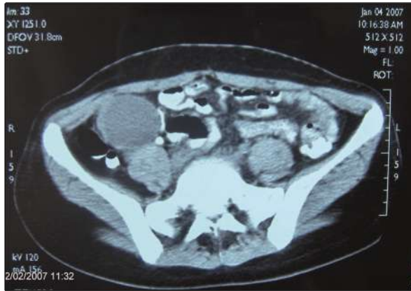
Figure 4. Right abdominal collection at the prior site of gossypiboma.

does not lead to generalized peritonitis and the calibration of the foreign body decides the outcome. If it is small enough or it may be shaped for effective passage through an intestinal lumen, peristaltic activity facilitates intraluminal passage and subsequent spontaneous expulsion with feces 8 .