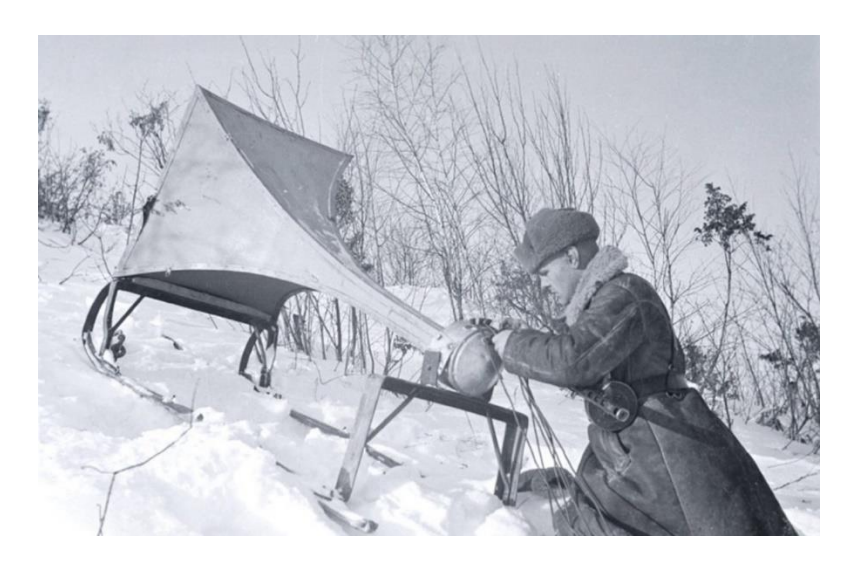
Fig. 2. Loudspeaker being moved to the forward line

If it was not possible for the truck to get to the front line, use would be made of the OZU, a mobile trench loudhailer unit (Figure 3).