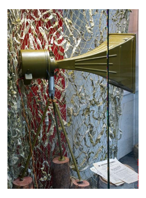
Fig. 3. Trench loudhailer unit (OZU)

If it was not possible for the truck to get to the front line, use would be made of the OZU, a mobile trench loudhailer unit (Figure 3).