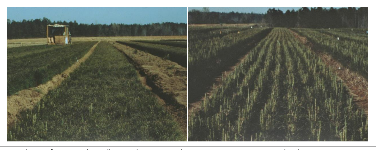
Figure 1. Photos of Pinus taeda seedlings at the Great Southern Nursery in Georgia were taken by Gary Cannon on March 3, 1982. Seedlings in the right photo were fertilized in September 25, 1981 with diammonium phosphate (140 kg ha<sup>-1</sup>) while those in the left photo were not treated. The fall-fertilized seedlings broke-bud sooner in the spring indicating nutrition affected seedling performance.

H0: When applying 310 I ha<sup>-1</sup> of solution to young sycamore (Platanus occidentalis) seedlings, there are no phytotoxic effects from applying 23-0-0 (urea) at 0, 10, 20, 40, 80 kg N ha<sup>-1</sup> (with no irrigation after application).