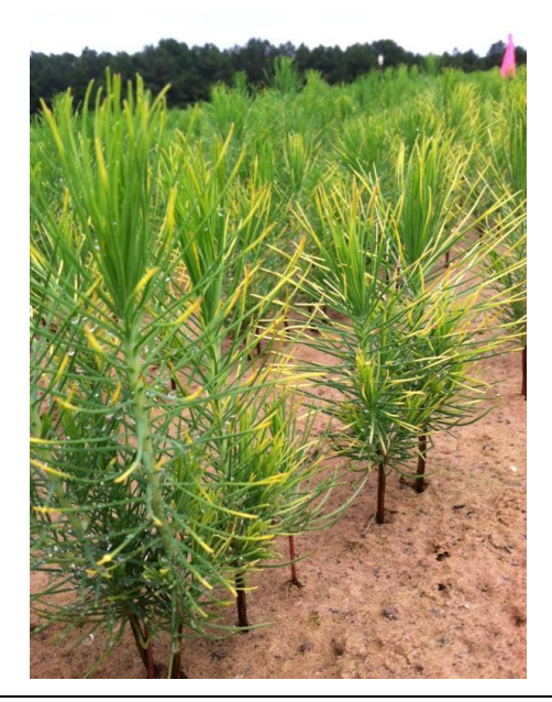
Figure 3. Pinus taeda seedlings showing tip chlorosis in July. Foliar nutrients were: 2.0% N, 0.24% P, 1.04% K, 0.08% Mg, 0.19% S, 0.2% Ca, 77 ppm B, 8 ppm Cu, 949 ppm Mn, and 236 ppm Al. Symptoms of Mg deficiency include chlorosis on tips of needles.

H0: Applying a pre-sow application of Epsom salt (0, 30, 60, 120 kg ha<sup>-1</sup> to a sandy soil with 25 ppm Mg) has no measurable effect on the morphology, rootgrowth potential and freeze tolerance of bareroot loblolly pine seedlings.