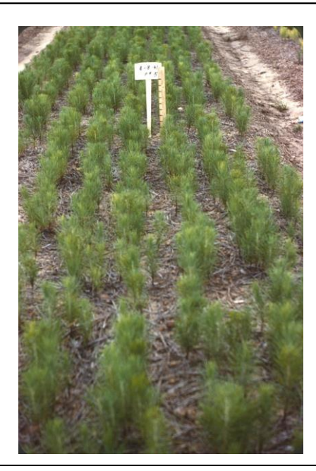
Figure 2. Pinus elliottii seedlings at the Page Nursery in Georgia (photo taken by Jack May August 8, 1961). Seedlings were growing in a loamy sand (33 ppm K) without any potassium fertilizer (Steinbeck et al. 1966). Nitrogen (112 kg ha<sup>-1</sup>) and phosphorus (244 kg ha<sup>-1</sup>) were mechanically incorporated into the soil two weeks before sowing (April 17, 1961) with no fertilization after sowing. In September, seedlings sampled from this treatment were 18 cm tall and foliar nutrient levels were; N-0.9%, P-0.13% and K-0.57%.

In some soils, seedlings can be grown without any K fertilization (Brissette et al. 1989; Khan et al. 2013; Mexal et al. 2002; South 1975; Wall 1994). Greenhouse studies indicated that K fertilization had little or no effect on sand pine ( Pinus clausa ) and slash pine seedlings (Brendemuehl 1968; Steinbeck et al. 1966). K deficiencies can occur when pines are grown in pure sand in greenhouses (McGee 1963) or perhaps in nursery soils with only 4 ppm K (Leach and Gresham 1983). A single liquid application of 28 kg ha<sup>-1</sup> of K may not be enough to prevent a K deficiency when applied as a top-dressing (Leach and Gresham 1983). Applying 10-0-6 (10% N and 5% K) as a liquid spray during the growing season might apply 180 kg N ha<sup>-1</sup> and 90 kg ha<sup>-1</sup> of K. When soil levels before sowing are less than 30 ppm, would this rate be sufficient to prevent a K deficiency?