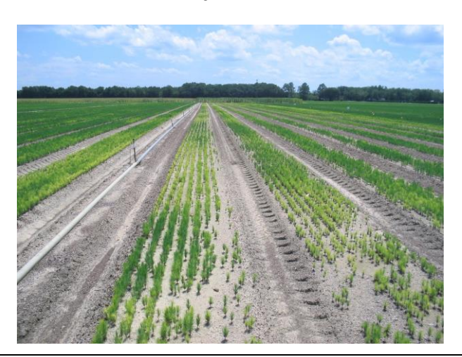
Figure 5. It has been estimated that 400 seedlings out of every million seedlings produced in southern nurseries are stunted due to a nutrient deficiency (Starkey et al. 2017). Most of these seedlings likely suffer from a phosphorus deficiency (South et al. 2018) but other deficiencies include Ca, Fe, Mg and S. On slightly acidic soils, high doses of N (and root injury from nematodes) induced chlorosis of Pinus taeda needles (Photo taken by David South on July 11, 2007).

H0: When nursery soil is at less than pH 5.5, the rate of Fe (0, 1, 2, 4 \text{ kg ha}^{-1}) applied to chlorotic seedlings in July has no effect on the color of loblolly pine foliage sampled one and two weeks after treatment.