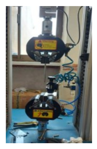
Figure 1. Sample mounted on the device

Finally, the data were analyzed SPSS 20 using T-test at significant level of P < 0.05.