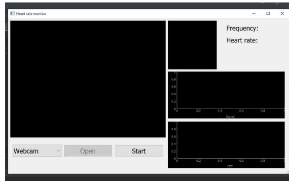
Figure 2: When You Click “START”.

At the beginning, our system looks like,