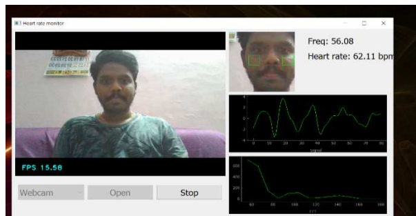
Figure 3: Your Heart Rate, Pulse Peak Graph, Fps Count on Separate Screen.