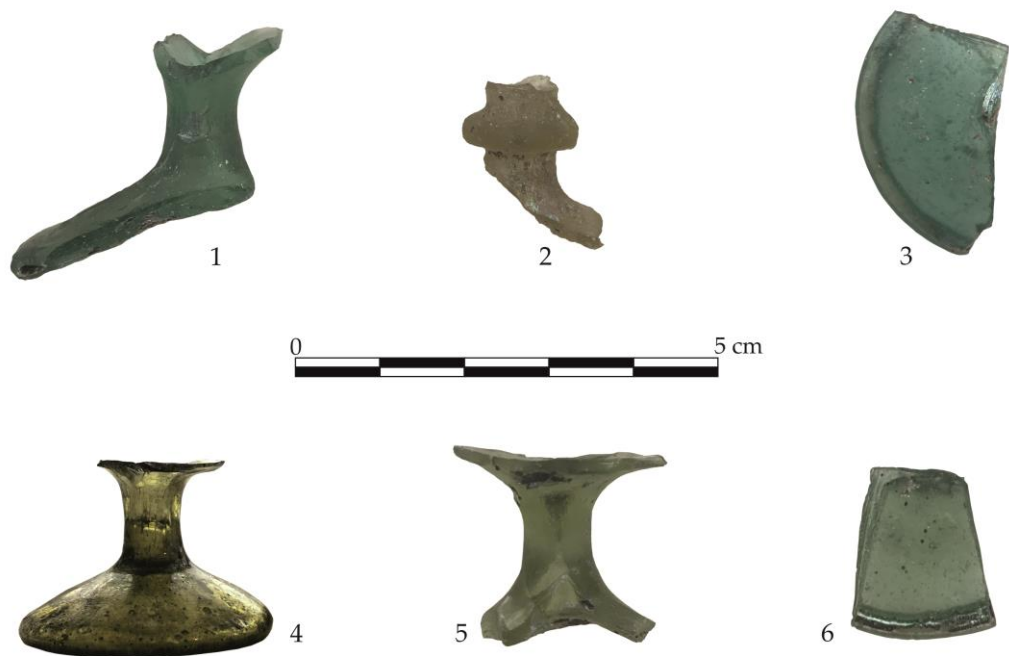
Fig. 3. Fragmentary stemmed goblets from the Centre-North Sector (Histria).

Analogies: similar to: Băjenaru, Băltăc 2006, cat. no. 26; Milavec, Šmit 2018, pl. 2, fig. 2; Buljević 2001, cat. no. 25, fig. 25; Fünfschilling, Lafli 2013, Taf. 2, VR1/48; Taf. 5, VR5/7; Czurda-Ruth 2007, Taf. 19, 634