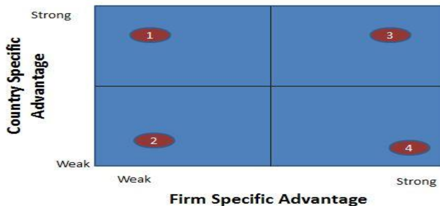
Fig. 1. Country/Firm Specific Advantage Matrix

To Hood & Young, (1979), while the firm-specific advantage at the firm level manifests itself in a higher productivity of comparable assets (tangible and intangible) than competitors (Caves, 1996), the location-advantage is basically the country-specific advantage which is immobile and is of a public-good nature as firms have access on equal terms. As location-advantage is bound to regions, it may lead to geographical fragmentation of value-added activities. Thus, the Figure 1 describes the relationship between Firm and Country Specific Advantage.